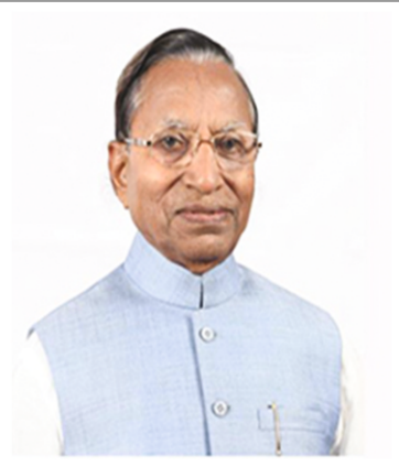
THE CHIEF RECTOR Shri Ganga Prasad Hon'ble Governor of Sikkim