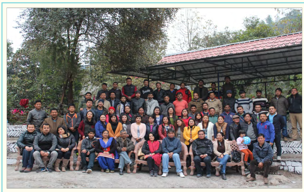
University staff picnic on 30 th January, 2016 at Smile land