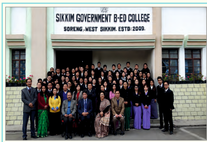
Hon'ble Vice-Chancellor with Principal, Teachers and Students of Sikkim Government B.Ed College, Soreng, West Sikkim during College visit on 24 th February 2016