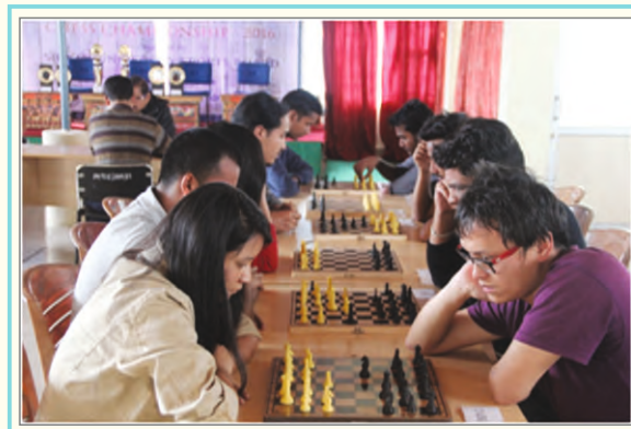
Chess Competition in progress March 2016