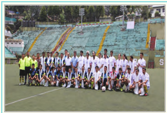
Exhibition football match between teaching faculty and management staff of Sikkim University at Paljor Stadium May 2015