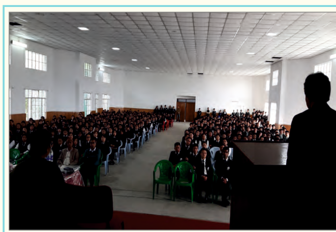
Hon'ble Vice-Chancellor participating with the students of Namchi Government College during College visit on 22 nd February 2016