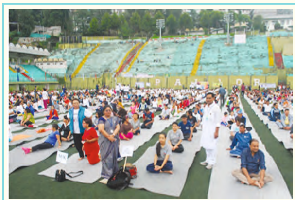
NSS volunteers on International Yoga Day at Paljor Stadium, Gangtok, 21st June, 2015

The NSS volunteers are not required to don uniform but wearing of NSS badge and cap in NSS programmes is mandatory. The Cell provides certificates to the participating students on completion of a minimum of 240 hours of regular activities and a special camp during a period of two years. The certificate has significant value in extra-curricular activities in the academic career of students.