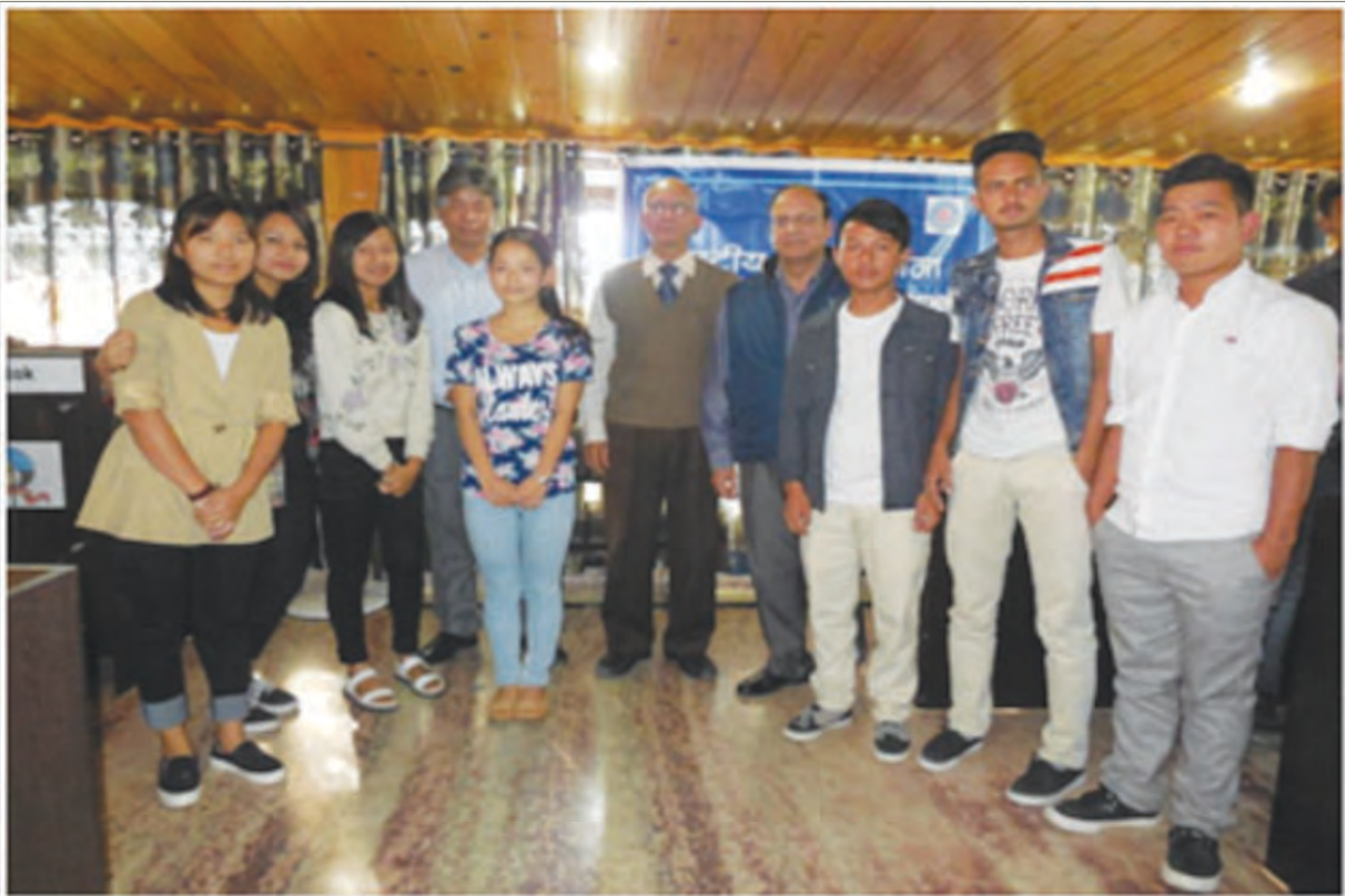
Winners of skit competition with Hon'ble Vice-Chancellor, Registrar and Finance Officer on 28th October, 2015