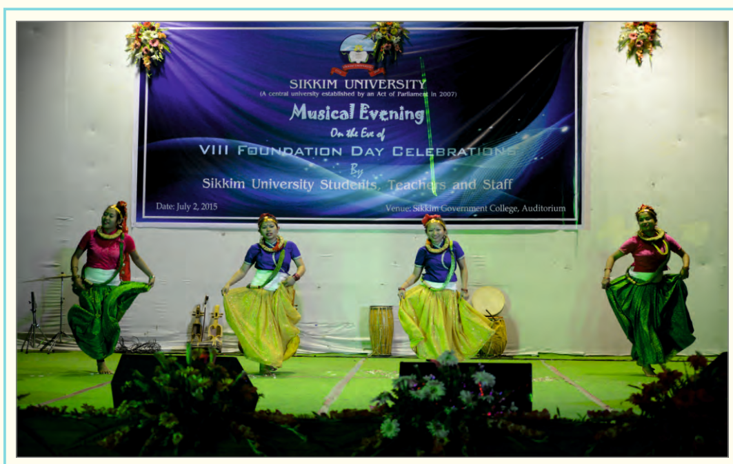
Students of Sikkim University performing cultural programme on VIII Foundation Day, 2 nd July 2015