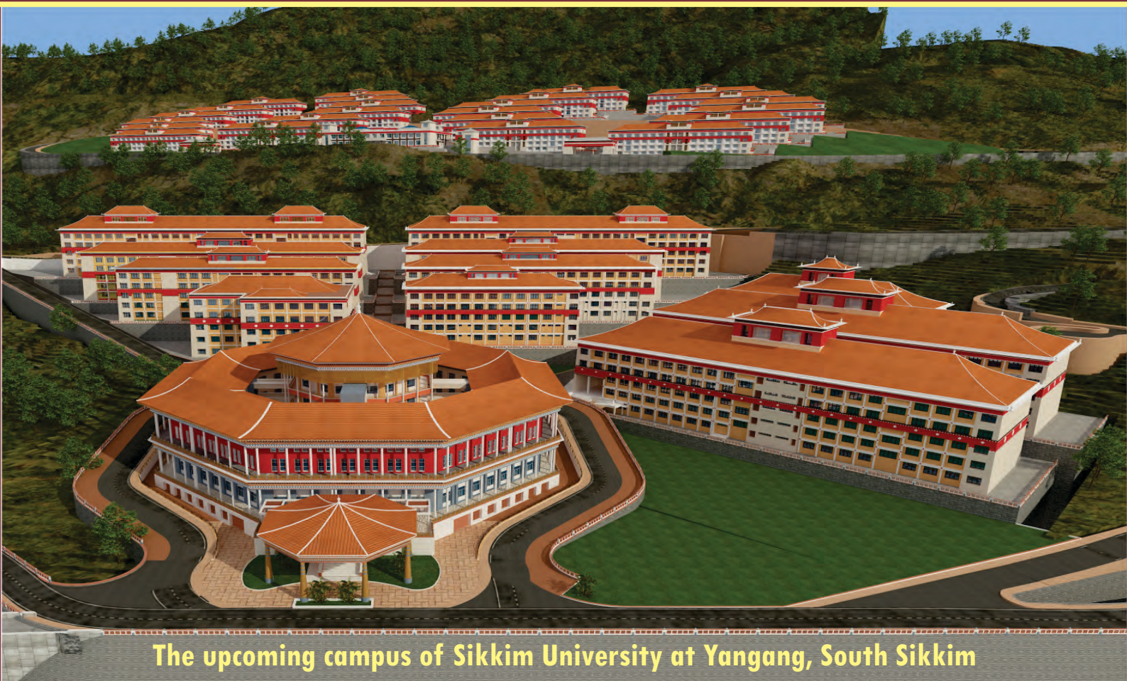
The upcoming campus of Sikkim University at Yangang, South Sikkim