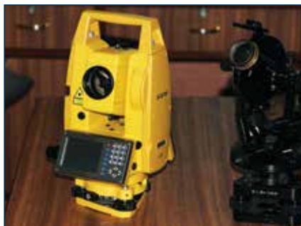
Total Station & Theodolite