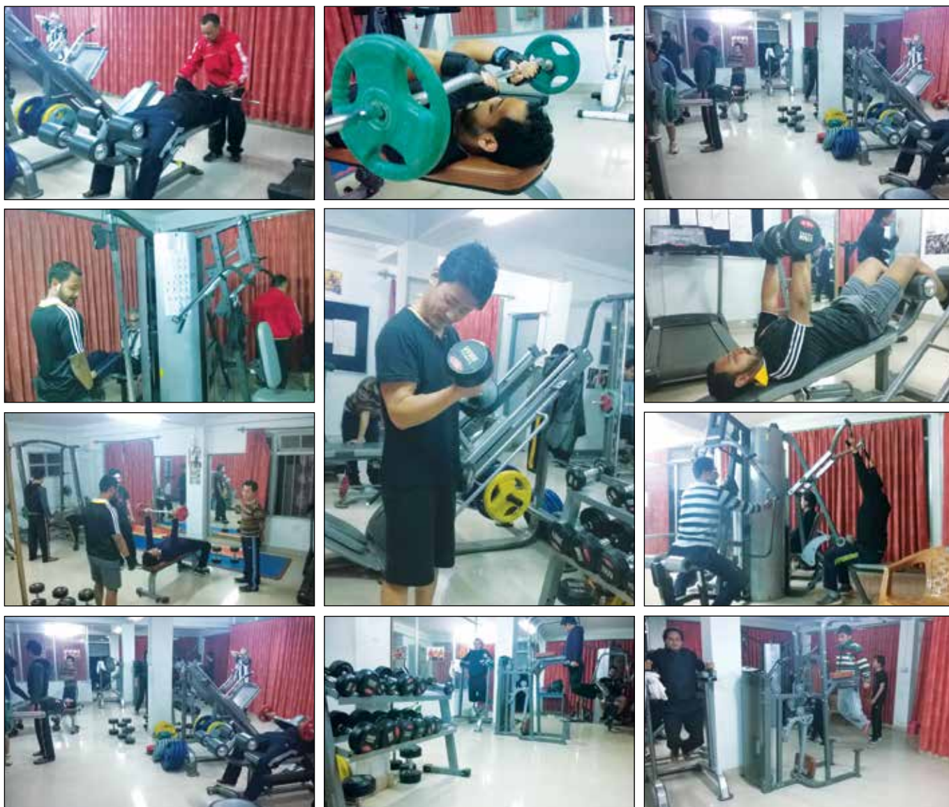
Students at the University GYM