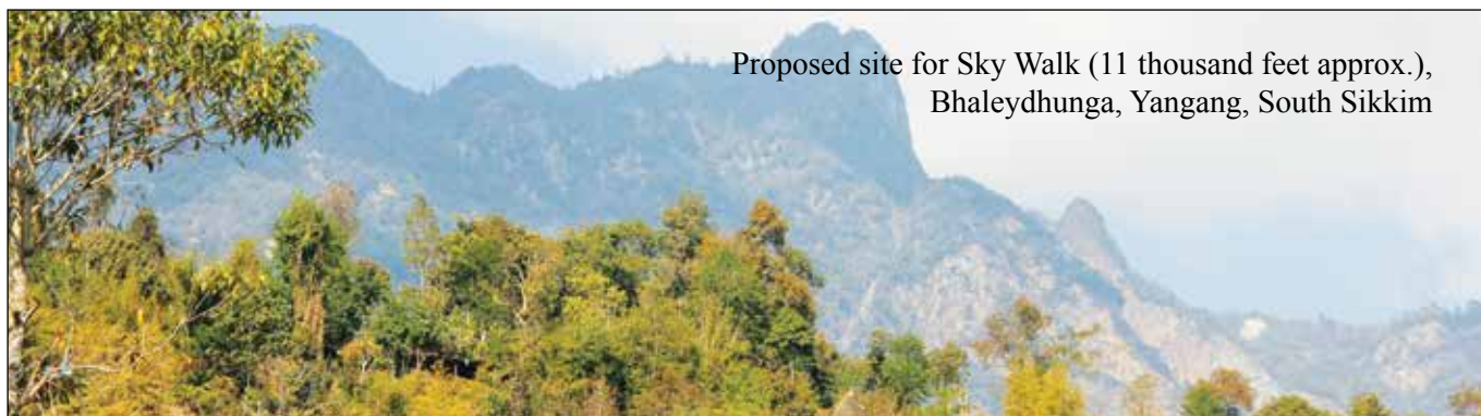
Proposed site for Sky Walk (11 thousand feet approx.), Bhaleydhunga, Yangang, South Sikkim