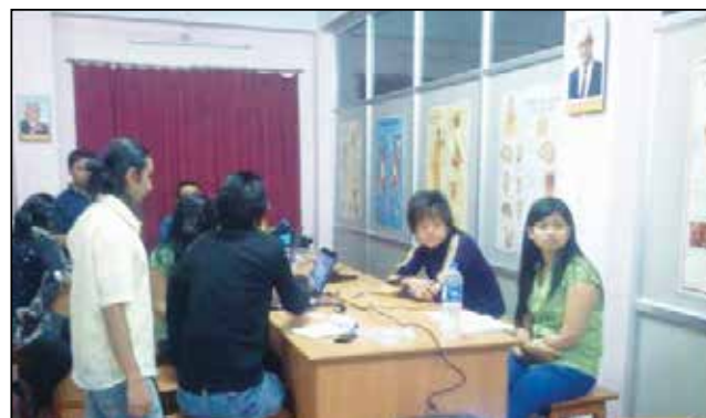
Students conducting practical in Psychology Lab.