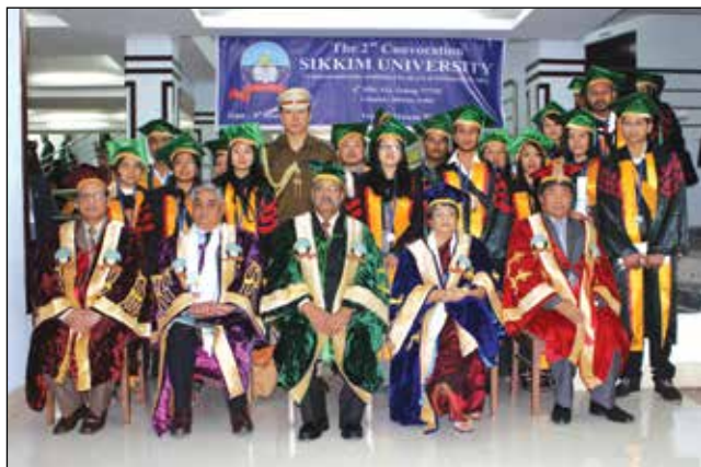
Awardees with Dignitaries

University. The Chief Rector of the University & Hon'ble Governor of Sikkim Sri Srinivas Patil also graced the occasion. The venue for the occasion was Manan Bhawan of the Government of Sikkim.