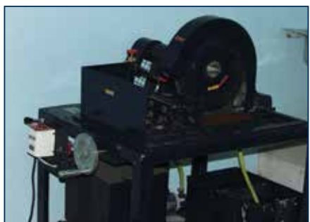
Petrological Section Cutting System