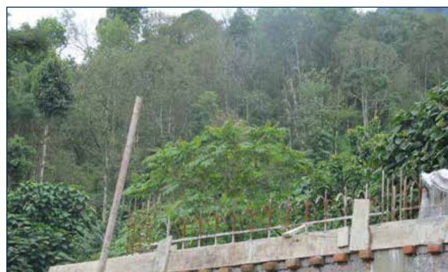
Construction of boundary wall in progress at Campus, Yangang