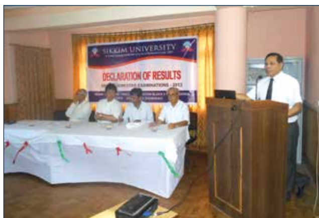
Declaration of Odd Semester Results-2013