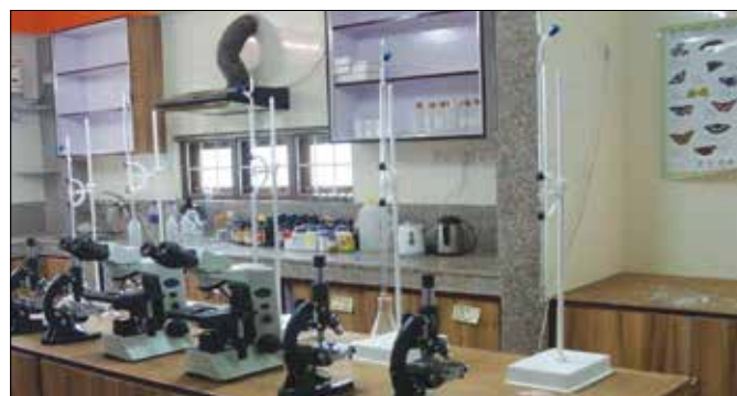
Upcoming laboratory of Department of Zoology along with instruments