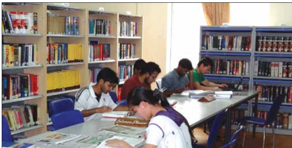
Students at the Central Library