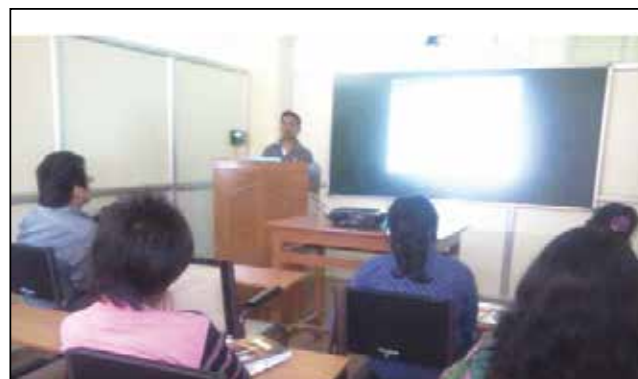
Students presenting paper on PPT