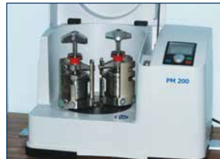
Planetary Ball Mill