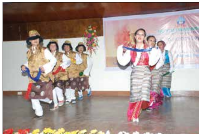
Cultural performance by students on the VI Foundation Day