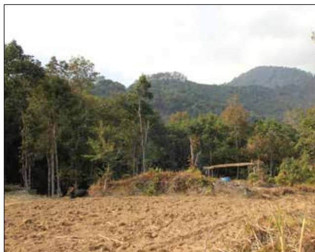
Campus land, Yangang, South Sikkim

The University is currently functioning from 22 hired buildings in and around Gangtok. The University has already started the process of campus building on a 300 acre land at Yangang in South Sikkim, which is 28 kms from Singtam, which is same as the distance between Singtam and Gangtok. On the northern fringe of the campus is a tourist village with traditional houses, ultra-modern conferencing facilities, children's park, etc. and on its western front lies the upcoming skywalk at a height of about 11 thousand feet asl atop Bhaledhunga overlooking the University campus. Bhaledhunga is a prime destination of the adventure tourists and is accessible from the campus through a trek route.