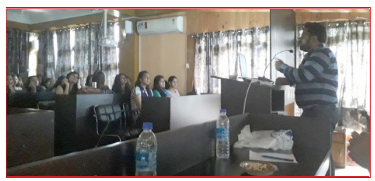
Special Lecture on Suicide Prevention among Youth