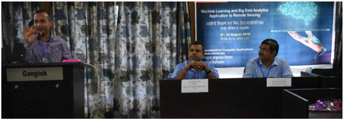
Two-days workshop on Machine Learning and Big Data Analytics-Application to Remote Sensing held on 19th -20th August 2019 at Barad Sadan. Workshop is jointly organized by IEEE GRSS, Sikkim University and NEILIT.