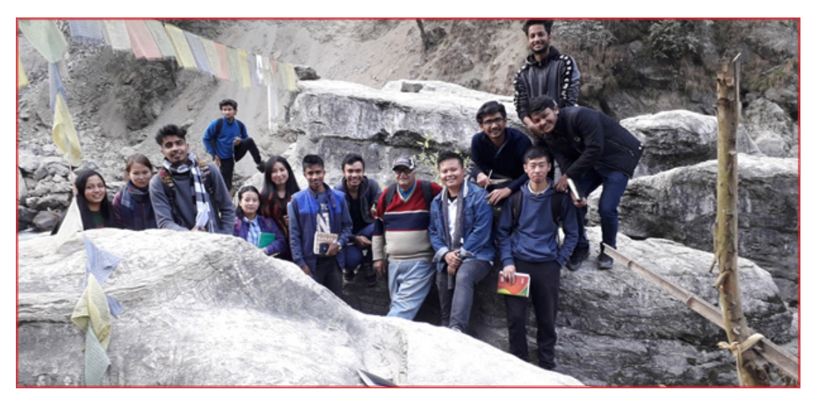
Undergraduate students of the Geology Department are observing the fossils of Early Life in Buxa Dolomite ( 1000 Million years old ) during field work in Rangeet River section, South Sikkim in December, 2019