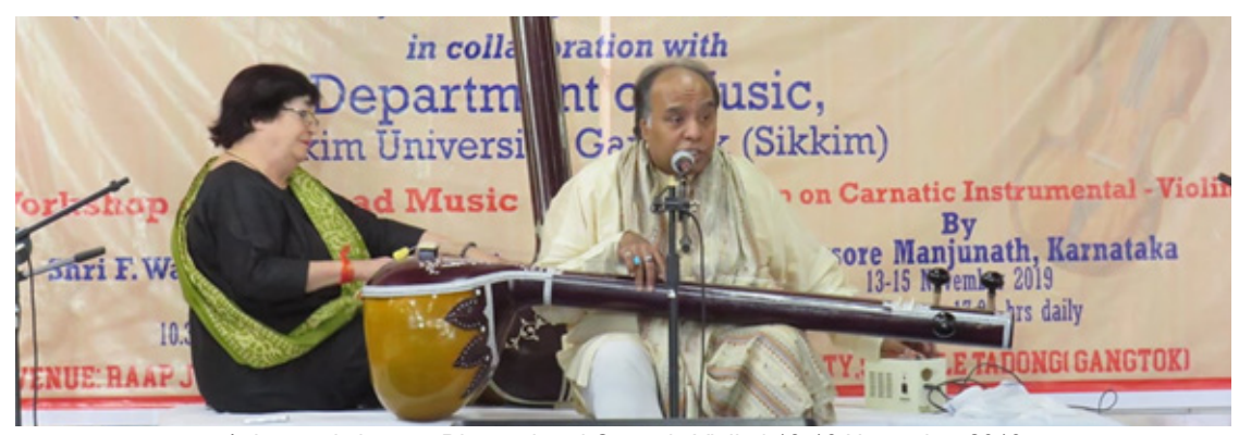
4-day workshop on Dhrupad and Carnatic Violin | 13-16 November 2019