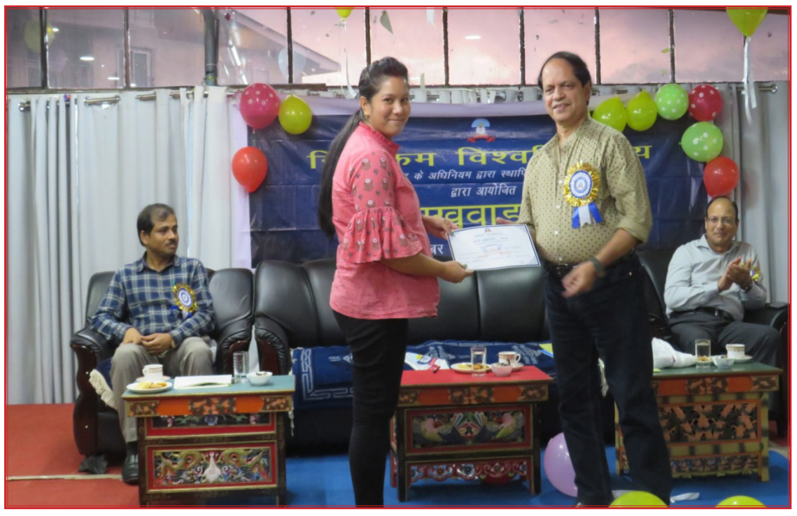
Cash Prize and Certificate distribution