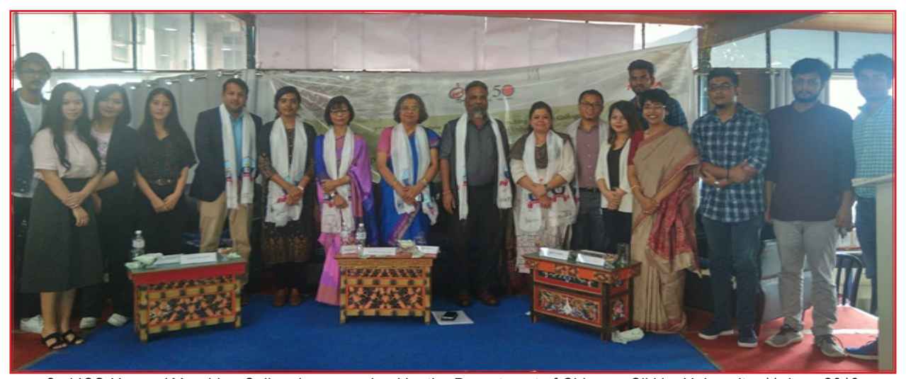
2nd ICS-Harvard Yenching Colloquium organized by the Department of Chinese, Sikkim University, 11 June 2019