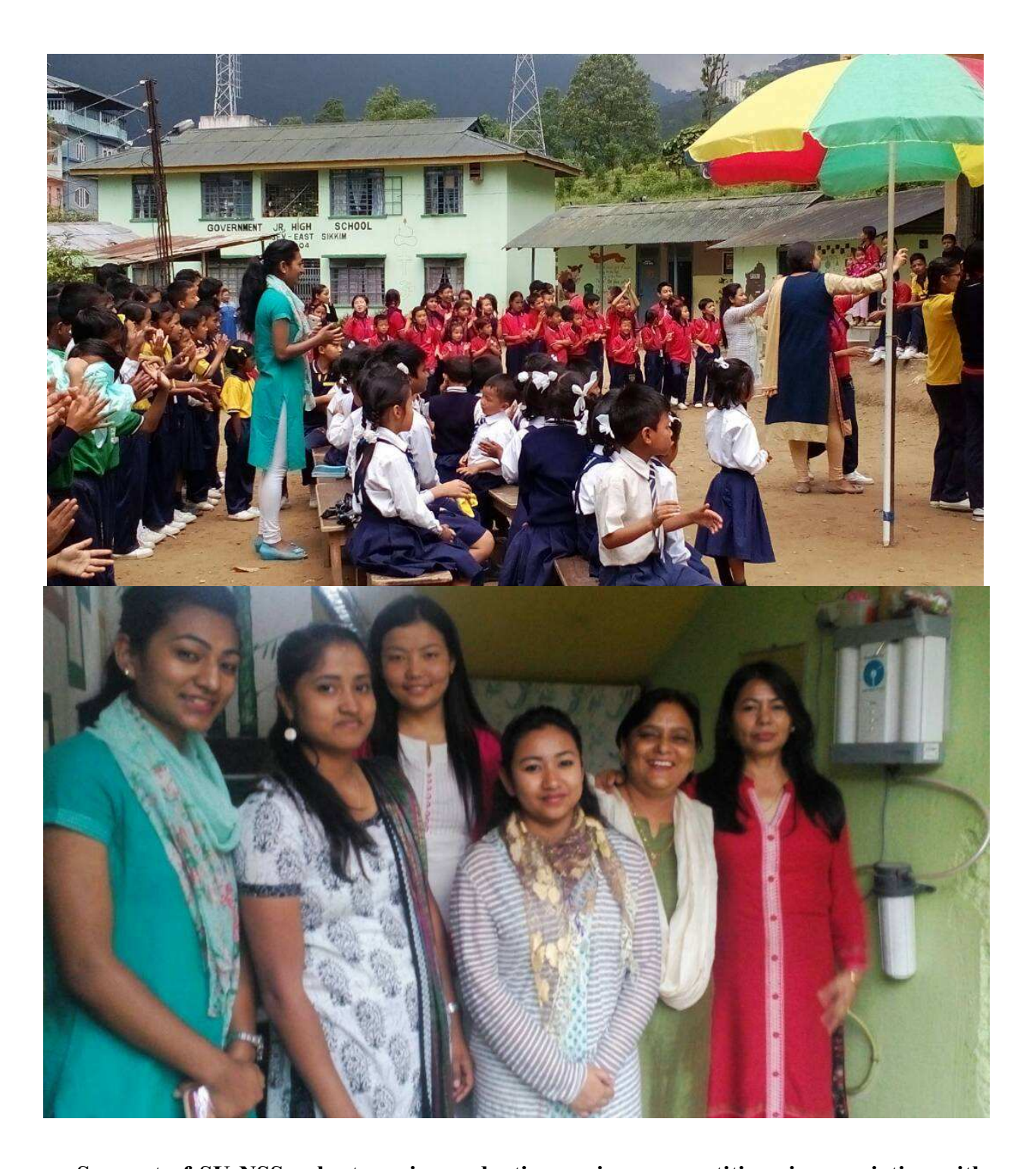
Support of SU NSS volunteers in conducting various competitions in association with Sri Sathya Sai Vidya Vahini, Gangtok at Govt. Senior Secondary School, Lumsey on 6^{\rm th} May, 2017