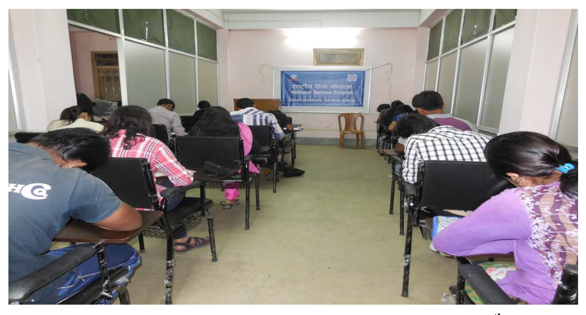
Essay competition organized on NSS Day at Dept. of Horticulture on 24<sup>th</sup> September, 2014