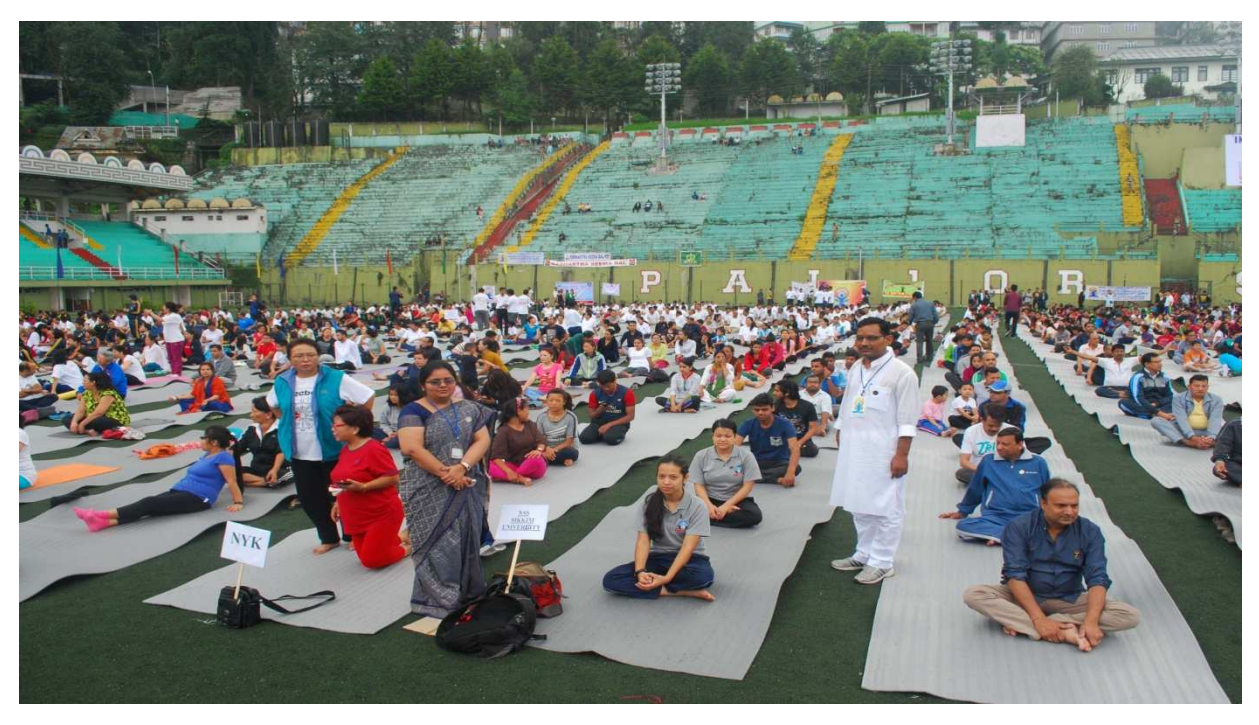
Representation of SU NSS Team at Govt. of Sikkim Programme at Paljor Stadium on International Yoga Day on 21^{st} June, 2015