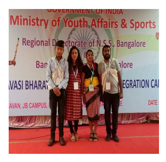
SU NSS volunteers at National Integration Camp, UAS, Bangalore (3<sup>rd</sup>-9<sup>th</sup> January, 2017)