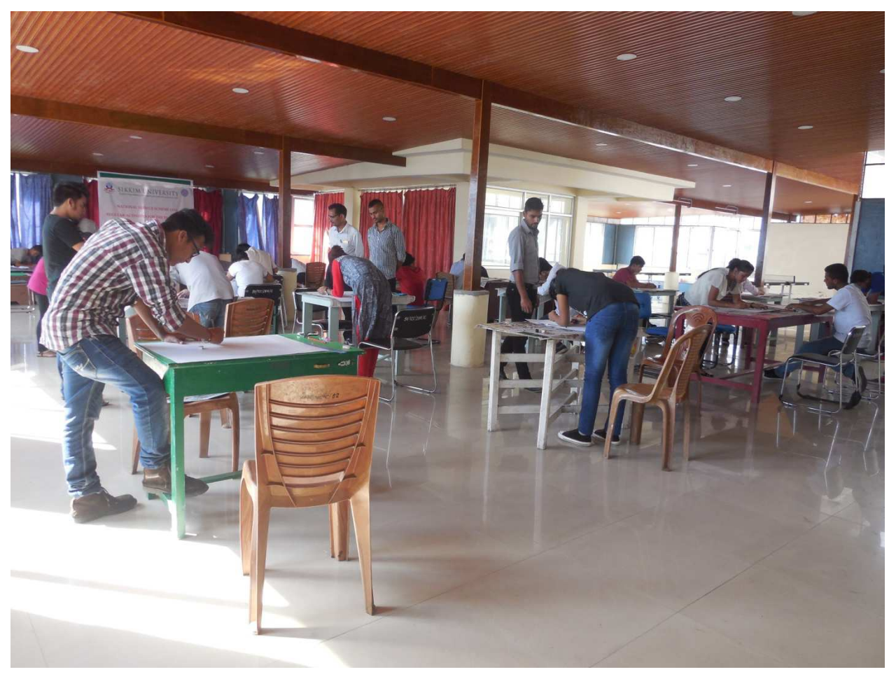
Sketch competition organized at Raap Jyor Cauvery Girls Hostel Hall, \mathbf{5}^{\text{th}} Mile on \mathbf{25}^{\text{th}} August, 2016