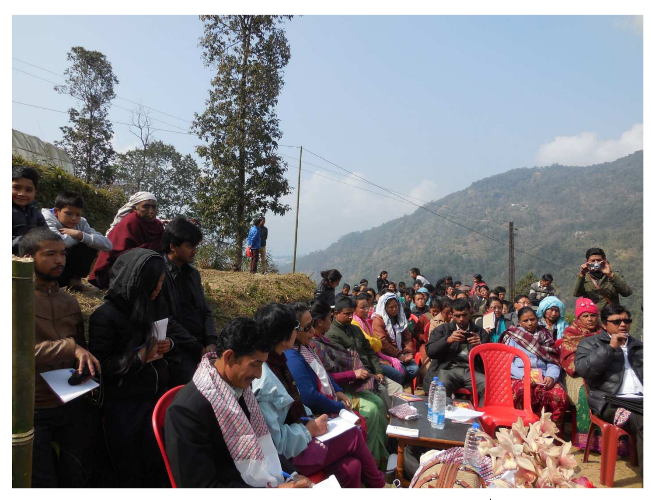
Photograph of Kisan Gosthi organized by ATMA (East) on 31st January, 2015