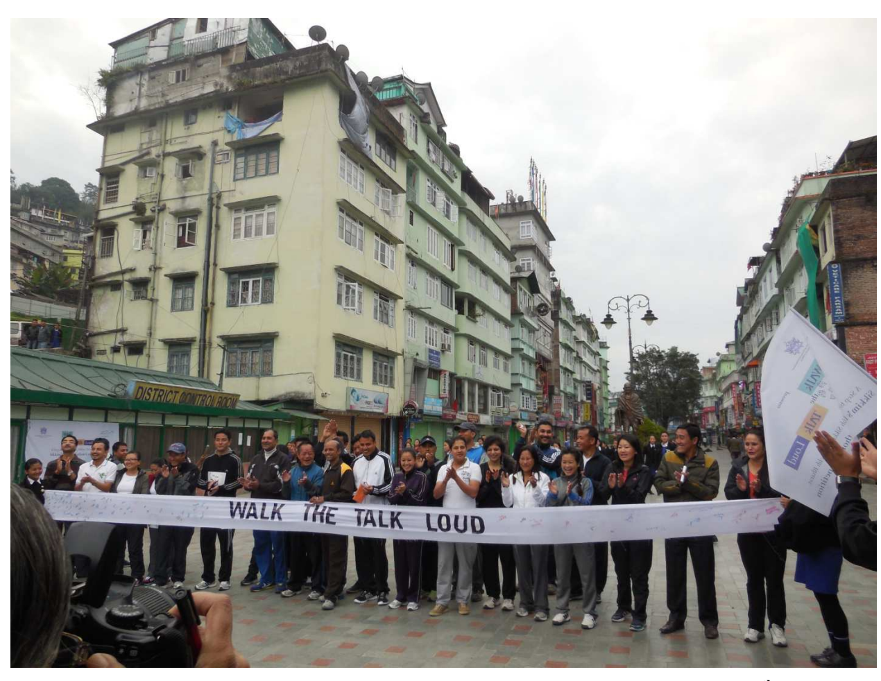
Staff members of Sikkim University in 1 Km walk on Walkathon contest on 30^{\rm th} October, 2015