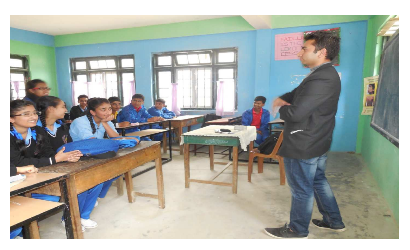
Interaction of NSS volunteer with school students on Zero Waste Management at Senior Secondary School, West Pandam on 15<sup>th</sup> November, 2014