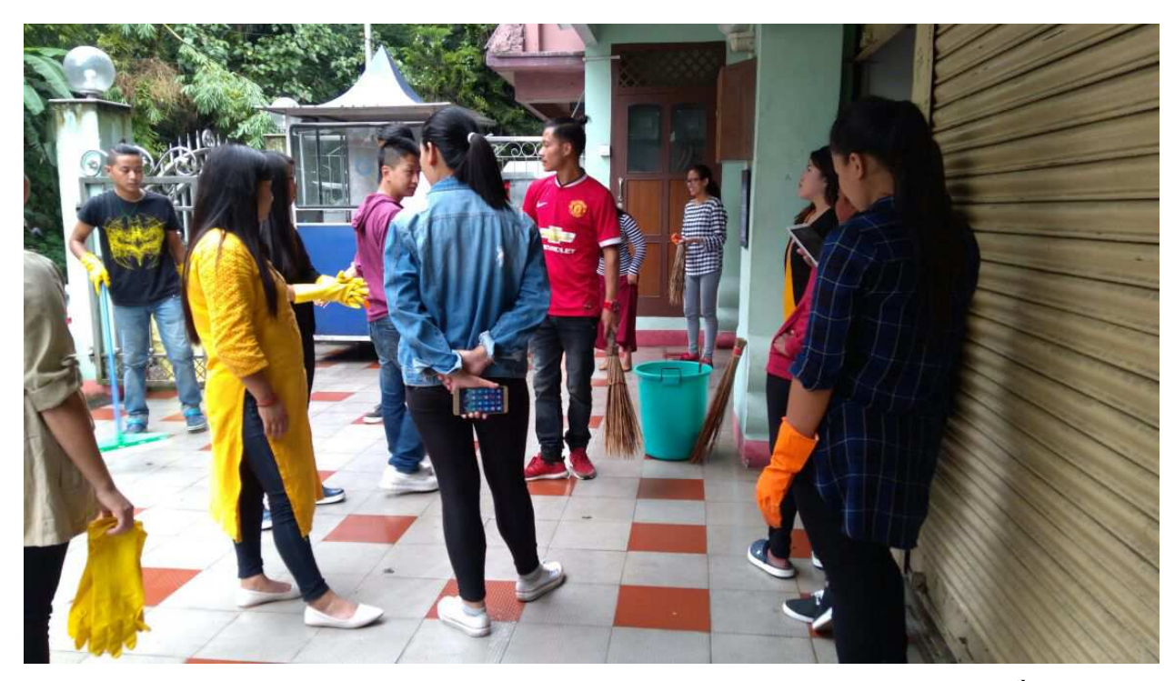
Cleaning drive at Dept. of Commerce as part of Swachchhata Pakhwada on 10^{\rm th} August, 2017