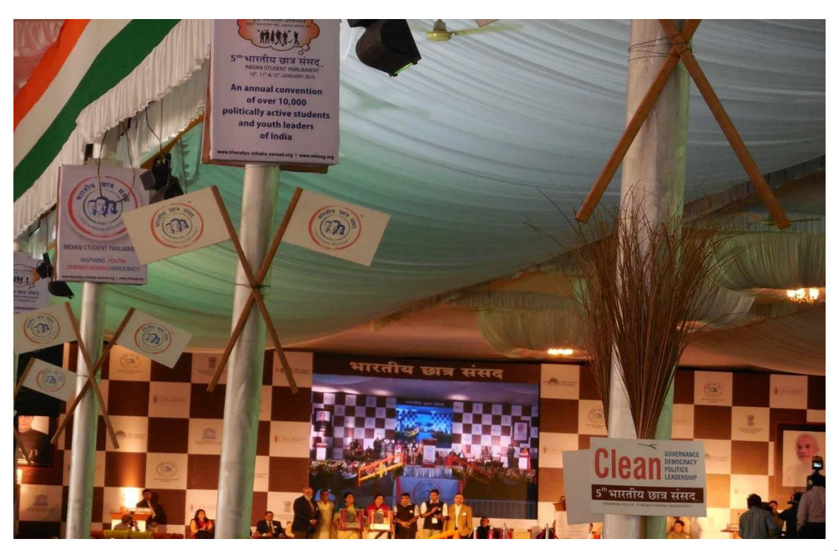
Dignitaries on the dais during ongoing session at Bharatiya Chhatra Sansad on 12^{\rm th} January, 2015