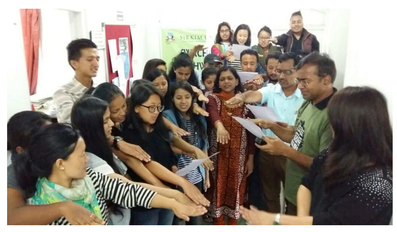
Oath taking on Swachchhata as part of Swachchhata Pakhwada at Dept. of Education on $10^{\rm th}$ August, 2017