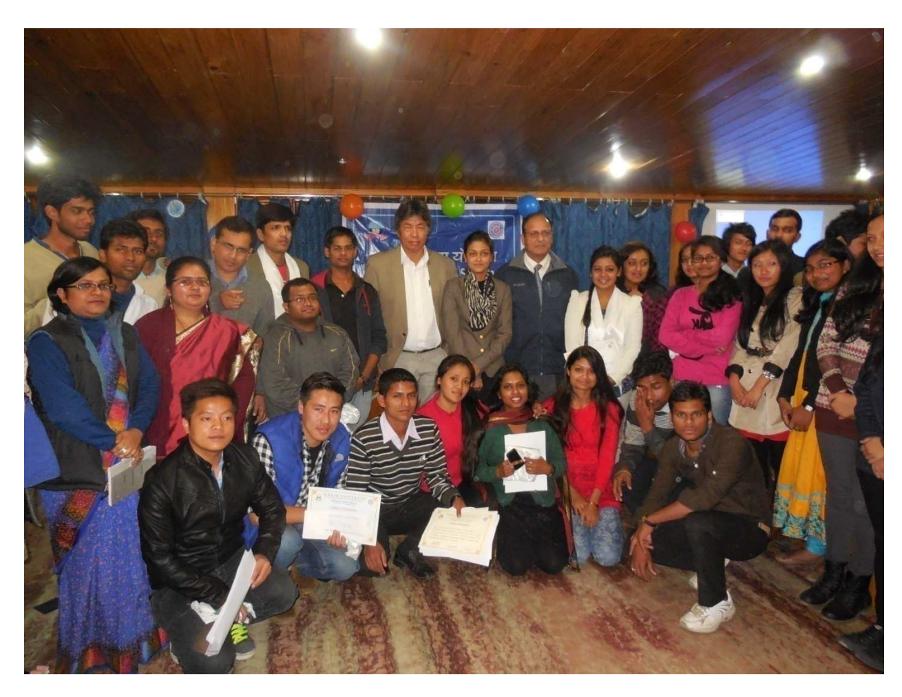
NSS Team along with Hon'ble Vice-Chancellor and Registrar at Prize Distribution Function on 20^{th} November, 2014