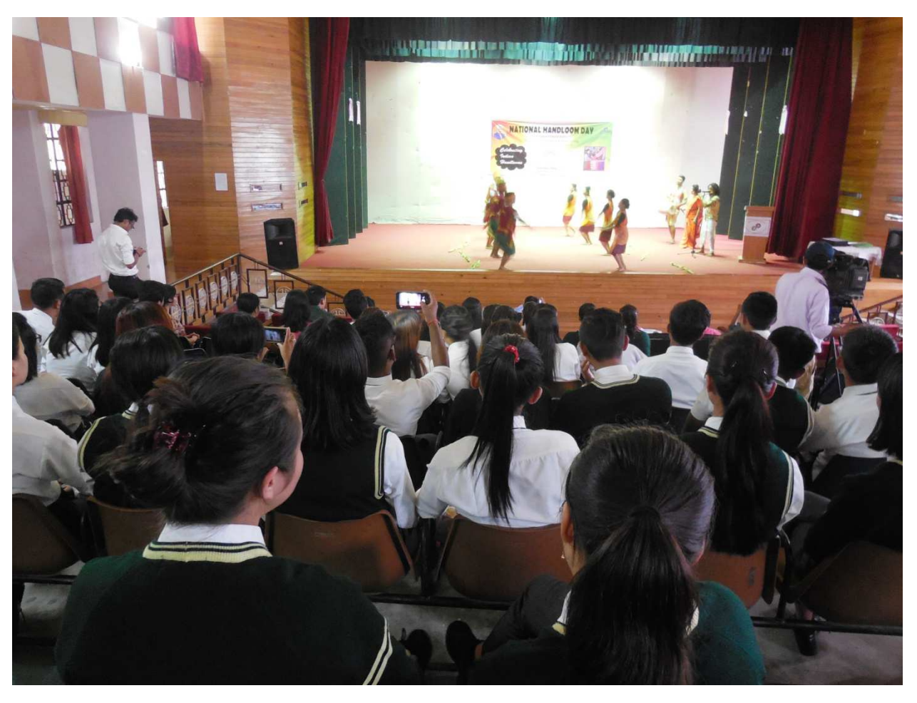
Participation of volunteers in National Handloom Day programme organized by DFP at SGC, Tadong on 5^{\rm th} August, 2017