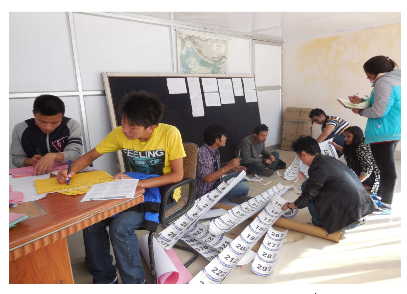
SU\ NSS\ volunteers\ during\ preparations\ for\ Sikkim\ Run\ Contest\ on\ 8^{th}\ November,\ 2014