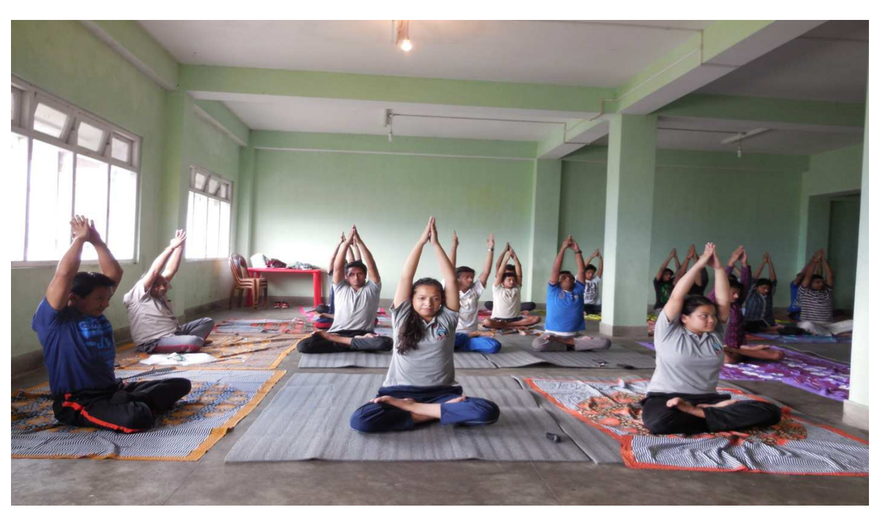
Participants performing Parvat Aasan during International Yoga Day programme on 21st June, 2015