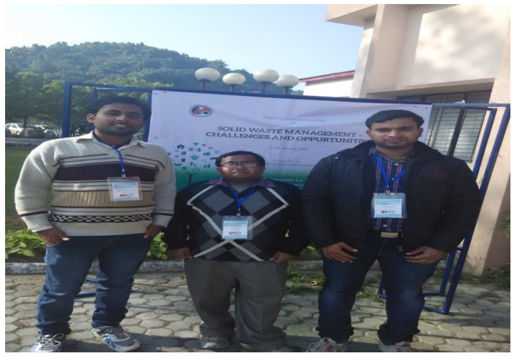
Participating students at IIT, Guwahati during training on Solid Waste Management ( 12^{th} to 14^{th} January, 2015