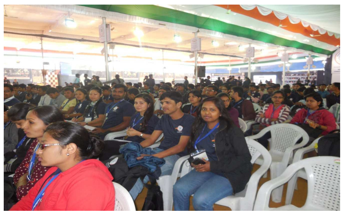
SU students attending lectures during ongoing session at Bharatiya Chhatra Sansad on 11<sup>th</sup> January, 2015