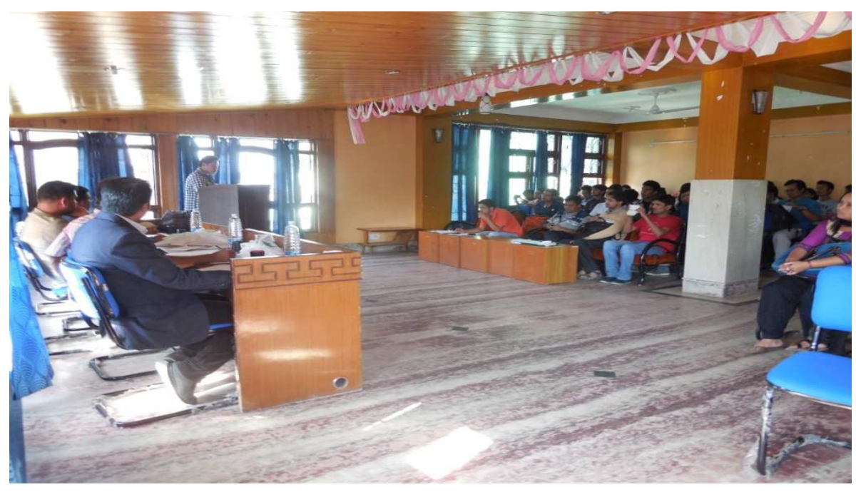
Debate competition organized at Sikkim University on 17<sup>th</sup> October, 2014