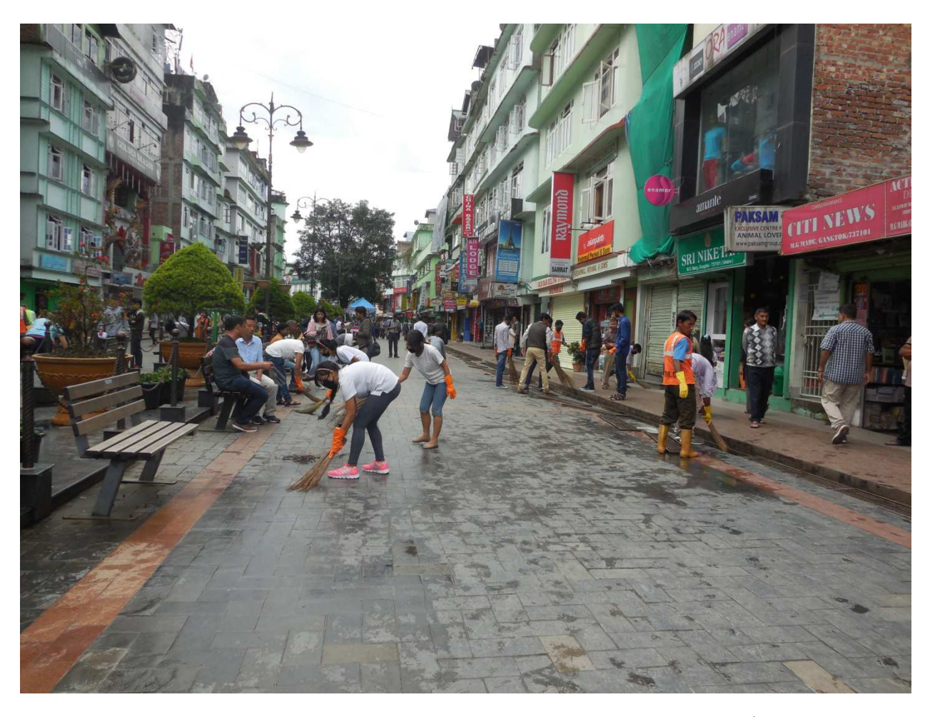
SU NSS volunteers performing cleaning drive at MG Marg, Gangtok on 1st October, 2016