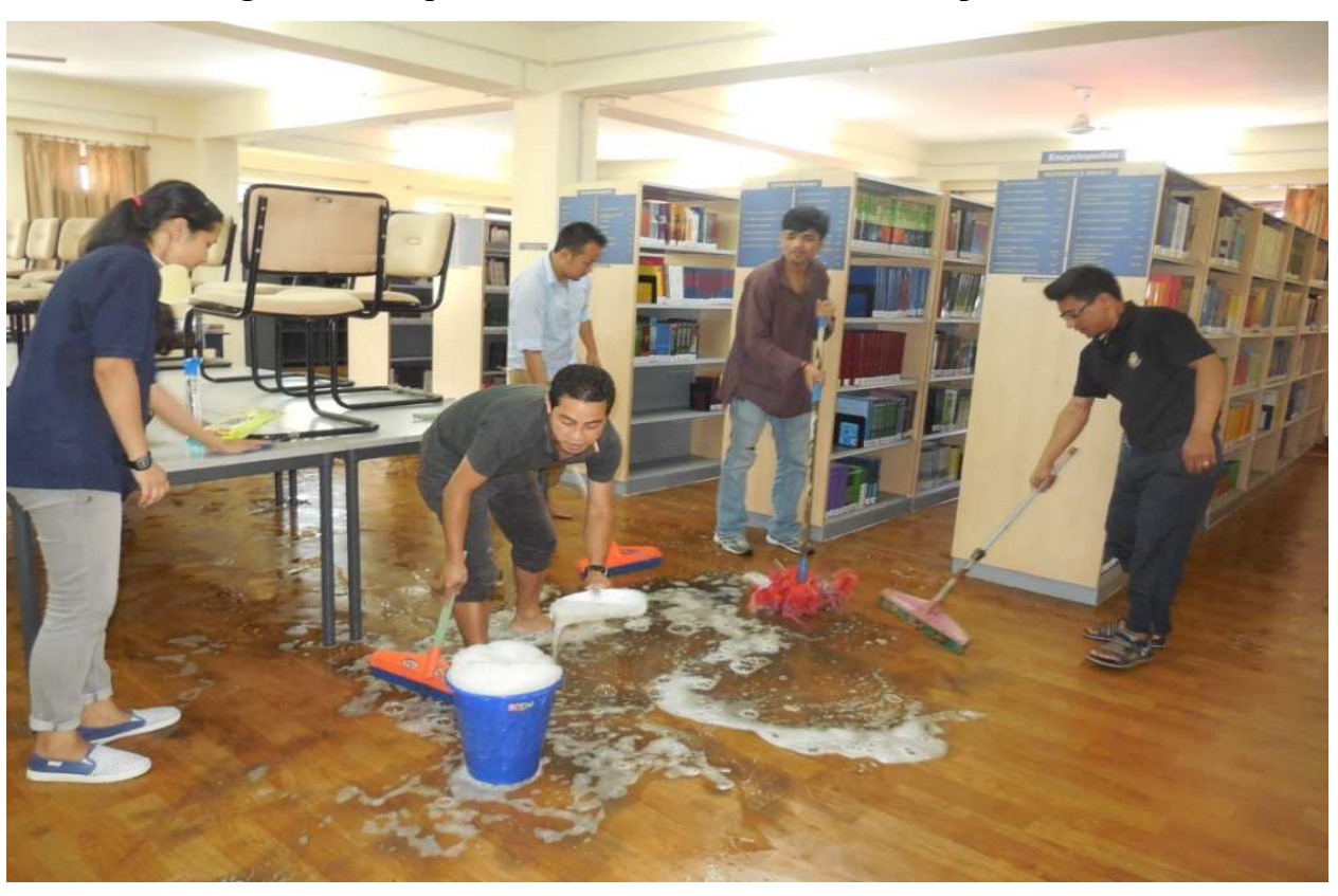
Cleaning drive at Central Library, 6<sup>th</sup> Mile on 19<sup>th</sup> April, 2015