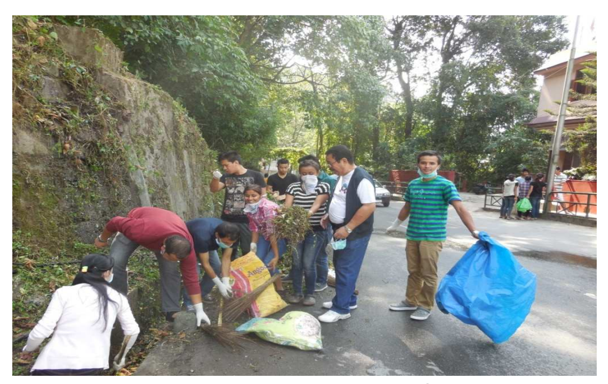
Cleaning Drive at Sikkim University on 18th October, 2014