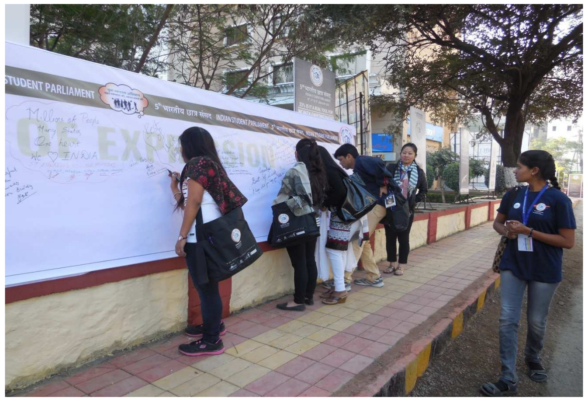
SU students writing messages on Bharatiya Chhatra Sansad at Flex on 12^{th} January, 2015