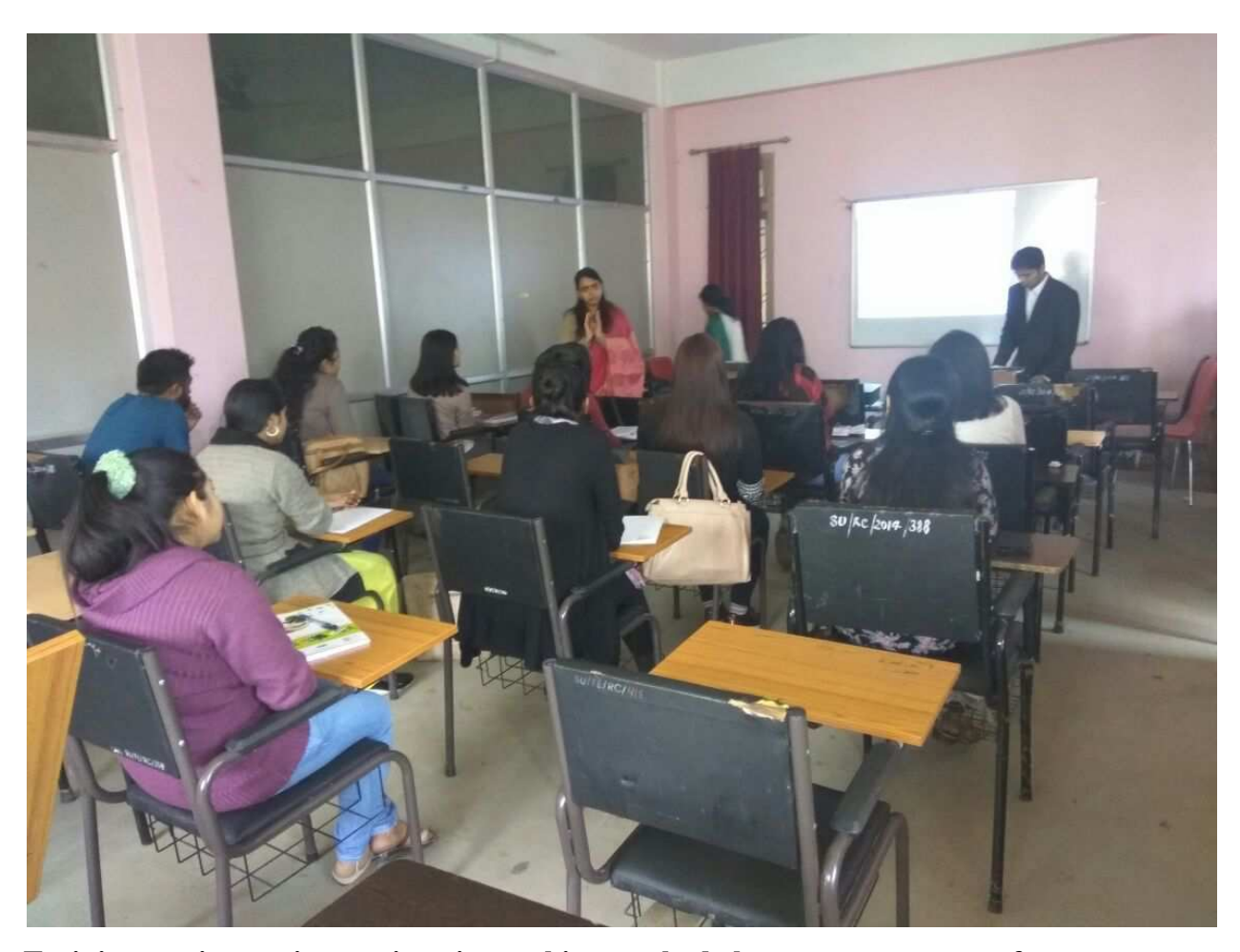
Training session on innovations in teaching methods by resource persons from Sri Sathya Sai Vidya Vahini, Gangtok at Dept. of Horticulture on 25<sup>th</sup> March, 2017