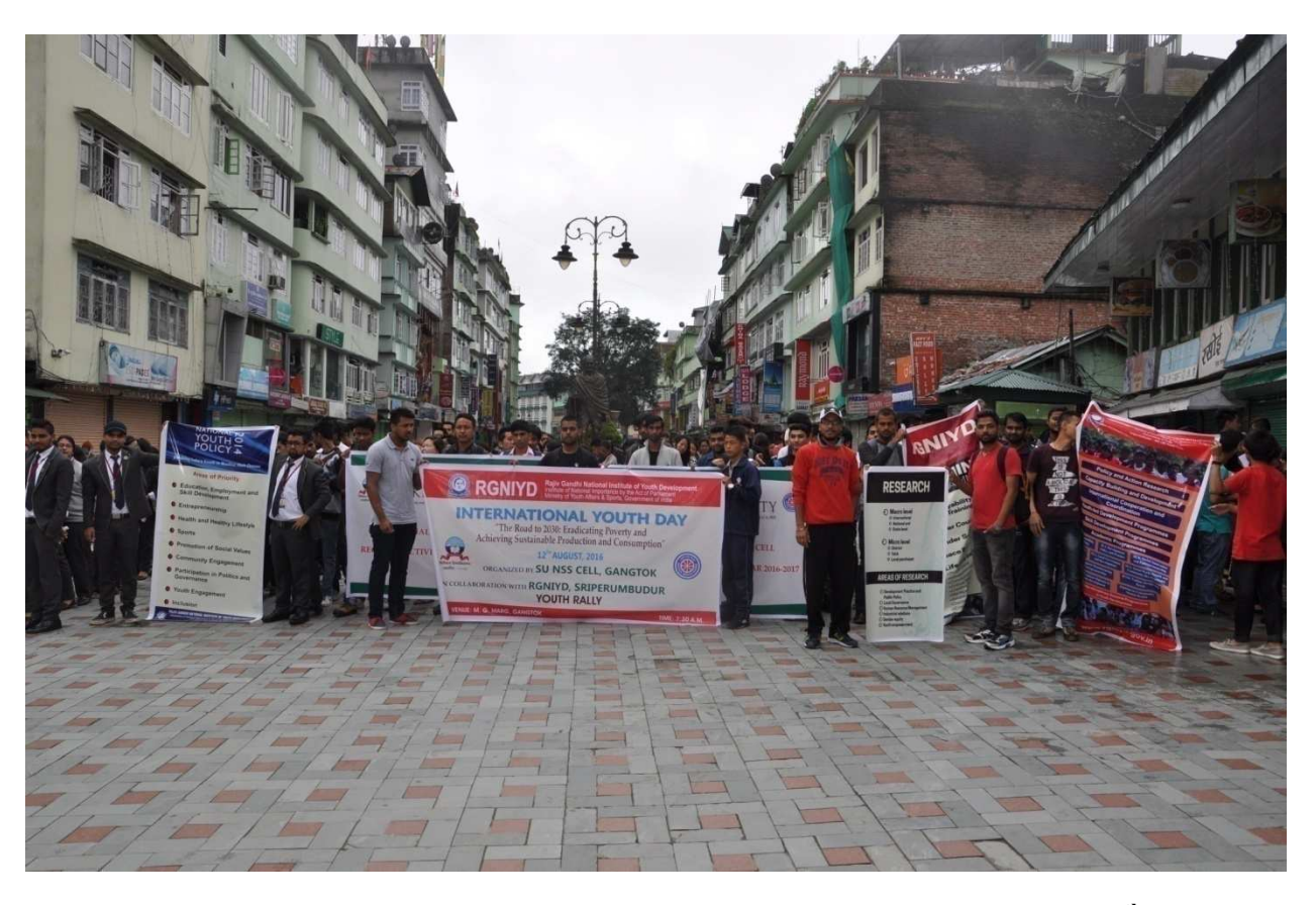
Youth rally starting at M.G Marg, Gangtok on International Youth Day on 12<sup>th</sup> August, 2016