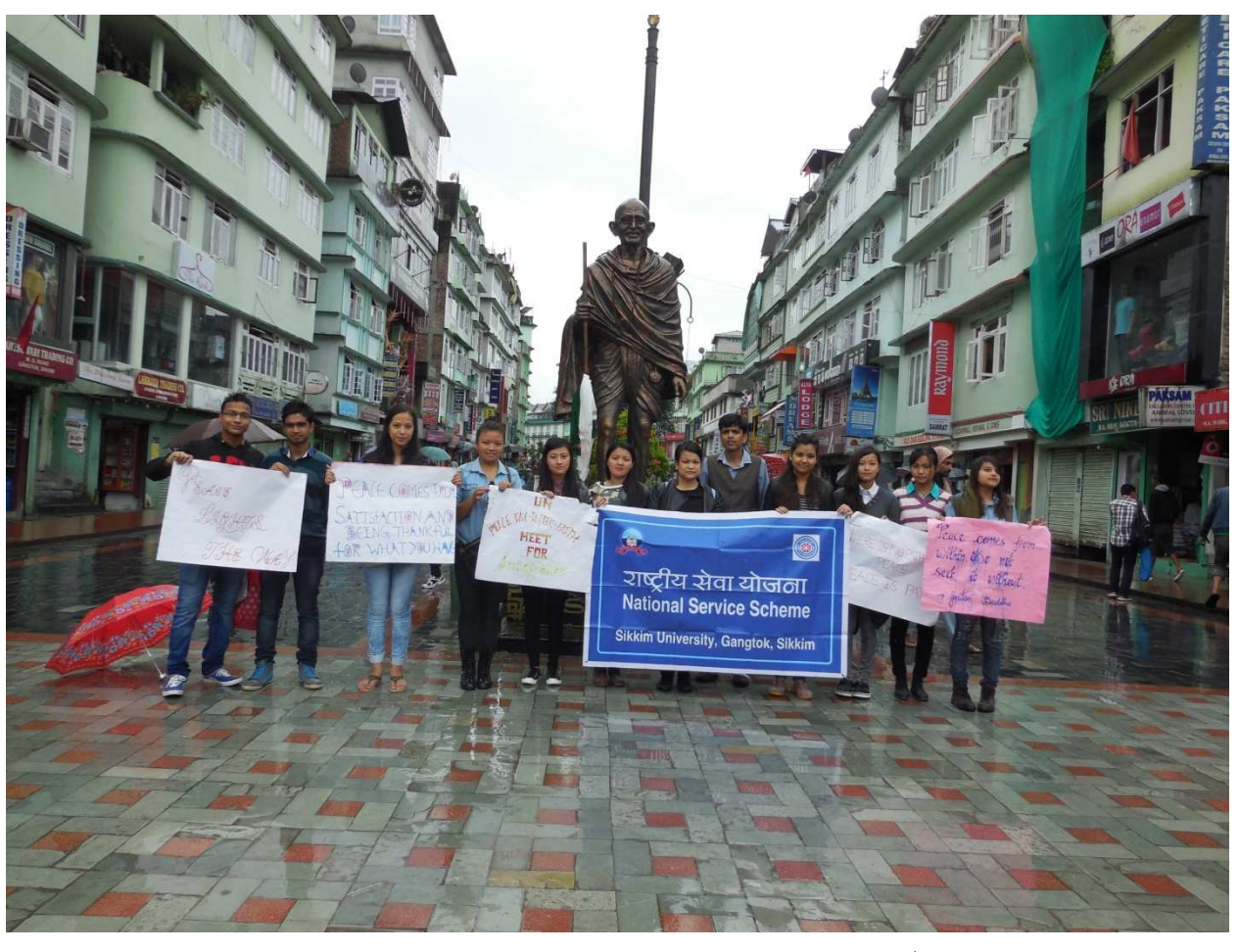
Participants of Peace Walk on International Peace Day on 21st September, 2015