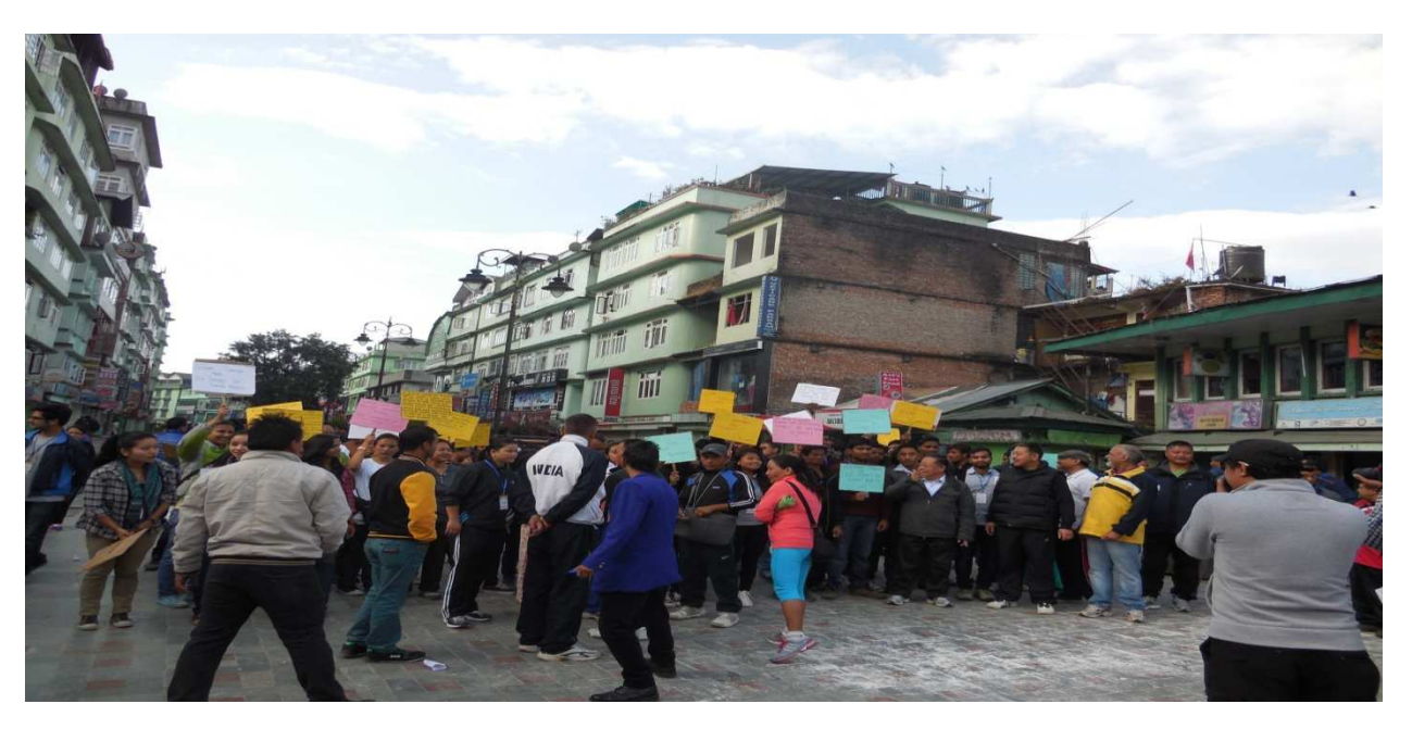
Participants of Dream Walk during Sikkim Run Contest on 9th November, 2014