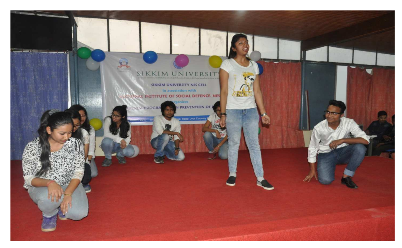
Skit performance by Sikkim University volunteers on theme "Prevention of Drugs Abuse" on \mathbf{1}^{\text{st}} March, 2017