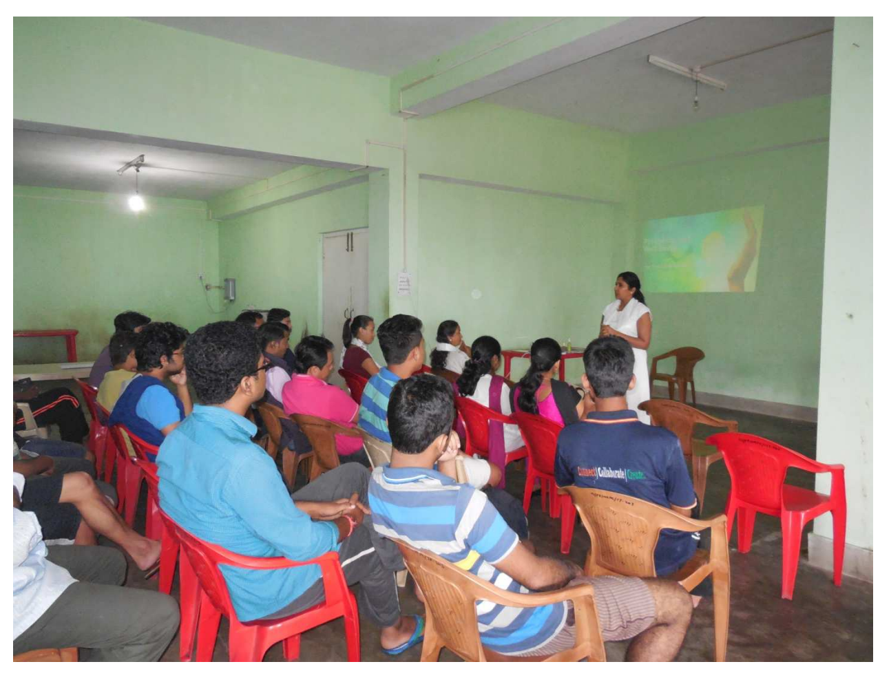
Meditation class organized at Teesta Boys' Hostel, Gangtok on 2<sup>nd</sup> October, 2015