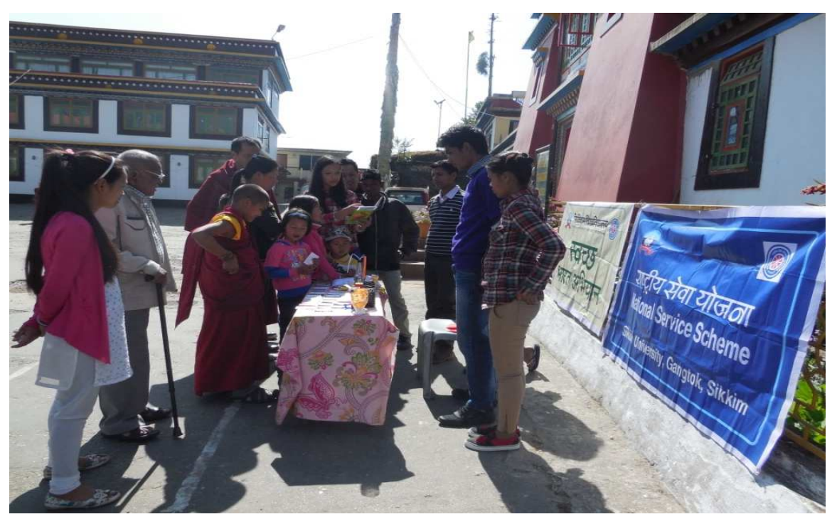
Exhibit Stall in front of Rumtek Monastery on 4<sup>th</sup> February, 2015