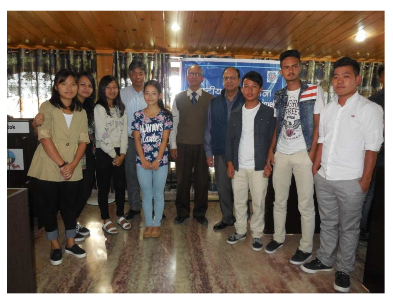
Winners of skit competition with Hon'ble Vice-Chancellor, Registrar and Finance Officer in Prize function on 28^{th} October, 2015