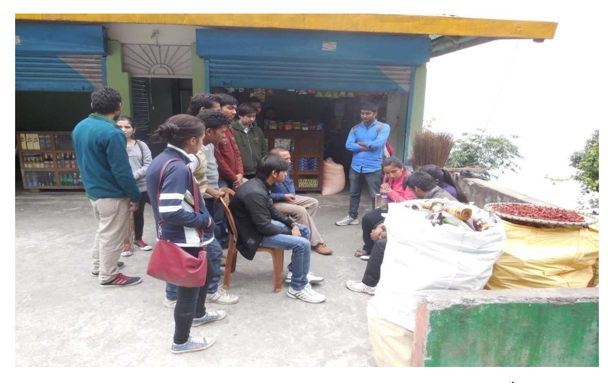
SU NSS team interacting with the farming families at West Pandam on 15^{\rm th} November, 2014