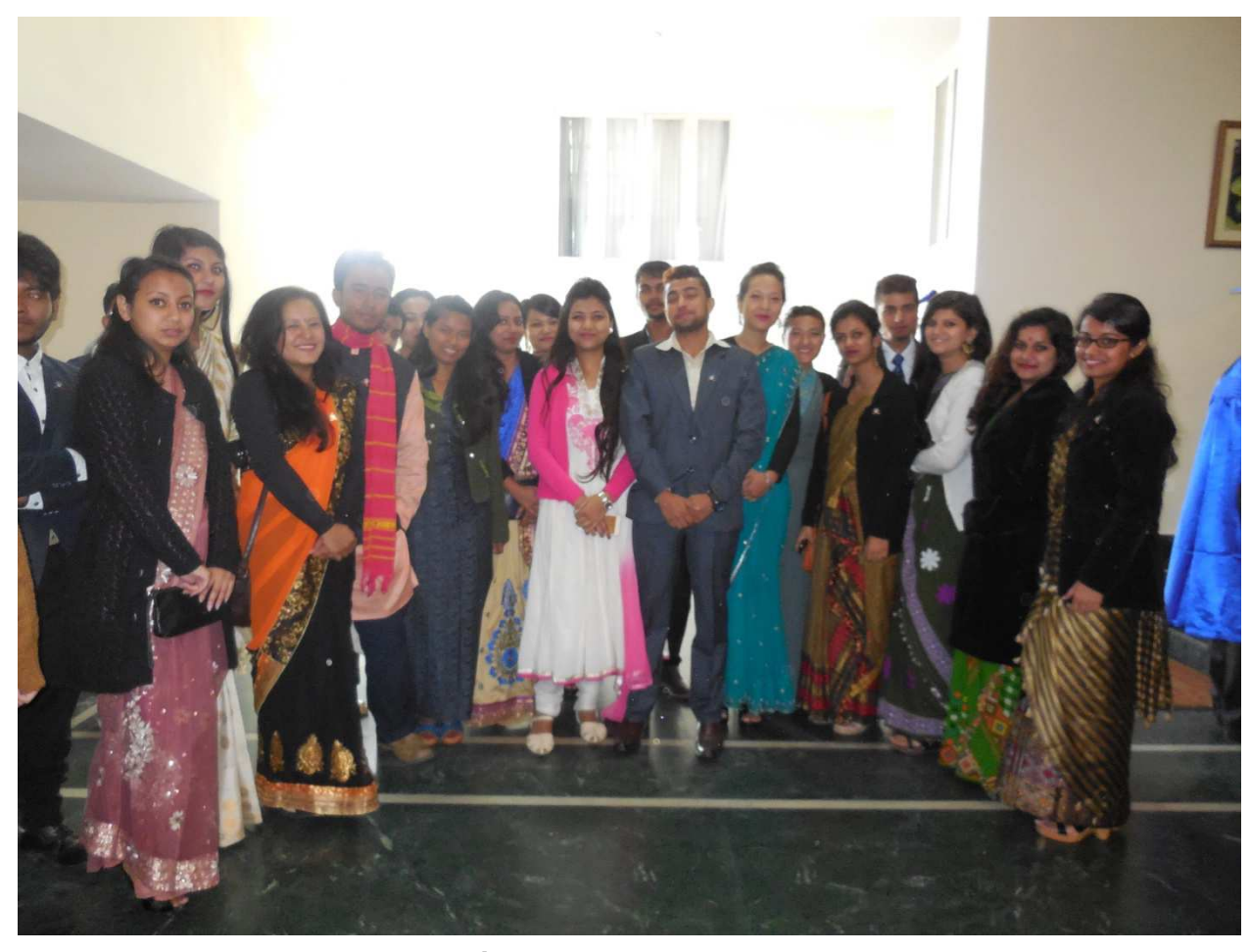
NSS volunteers participating in 3<sup>rd</sup> Convocation of Sikkim University at Chintan Bhawan on 9<sup>th</sup> November, 2015