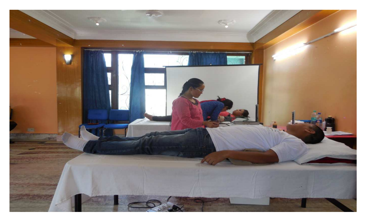
Blood donation organized at Barad Sadan, 5<sup>th</sup> Mile, Gangtok on 26<sup>th</sup> June, 2014