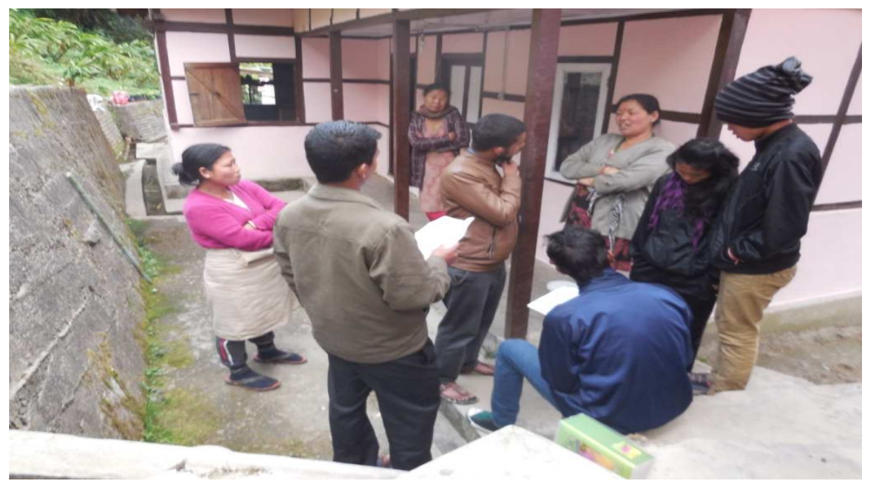
Volunteers doing survey at Assamlingzey during special camp (27<sup>th</sup> January, 2015)