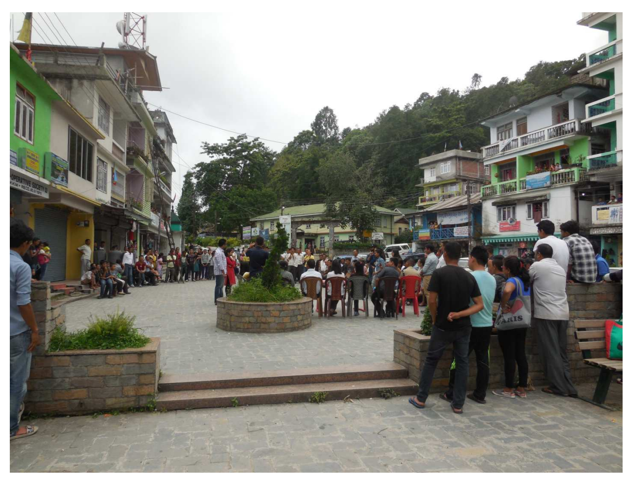
SU NSS volunteers performing street play at Yangang market on 18<sup>th</sup> June, 2016