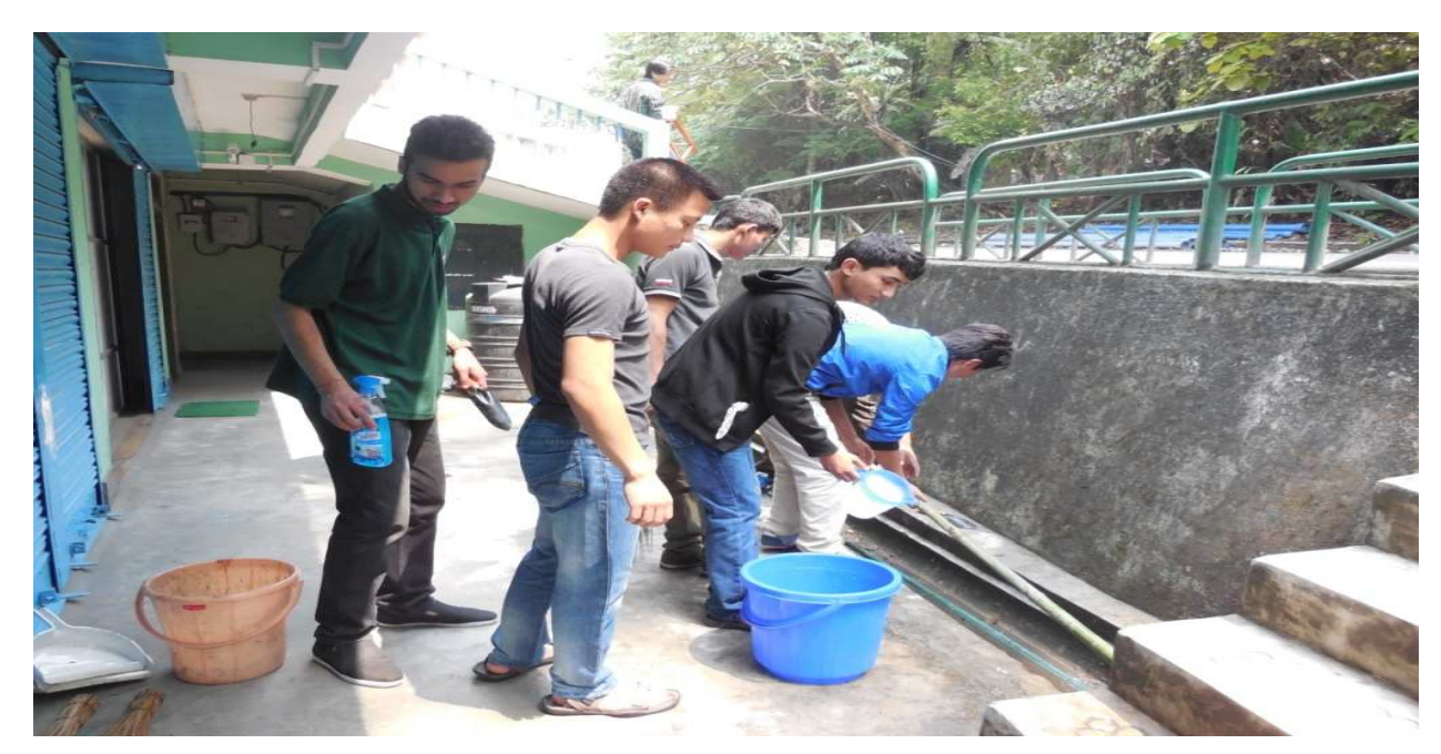
Cleaning drive at Dept. of Horticulture, 6<sup>th</sup> Mile on 11<sup>th</sup> April, 2015