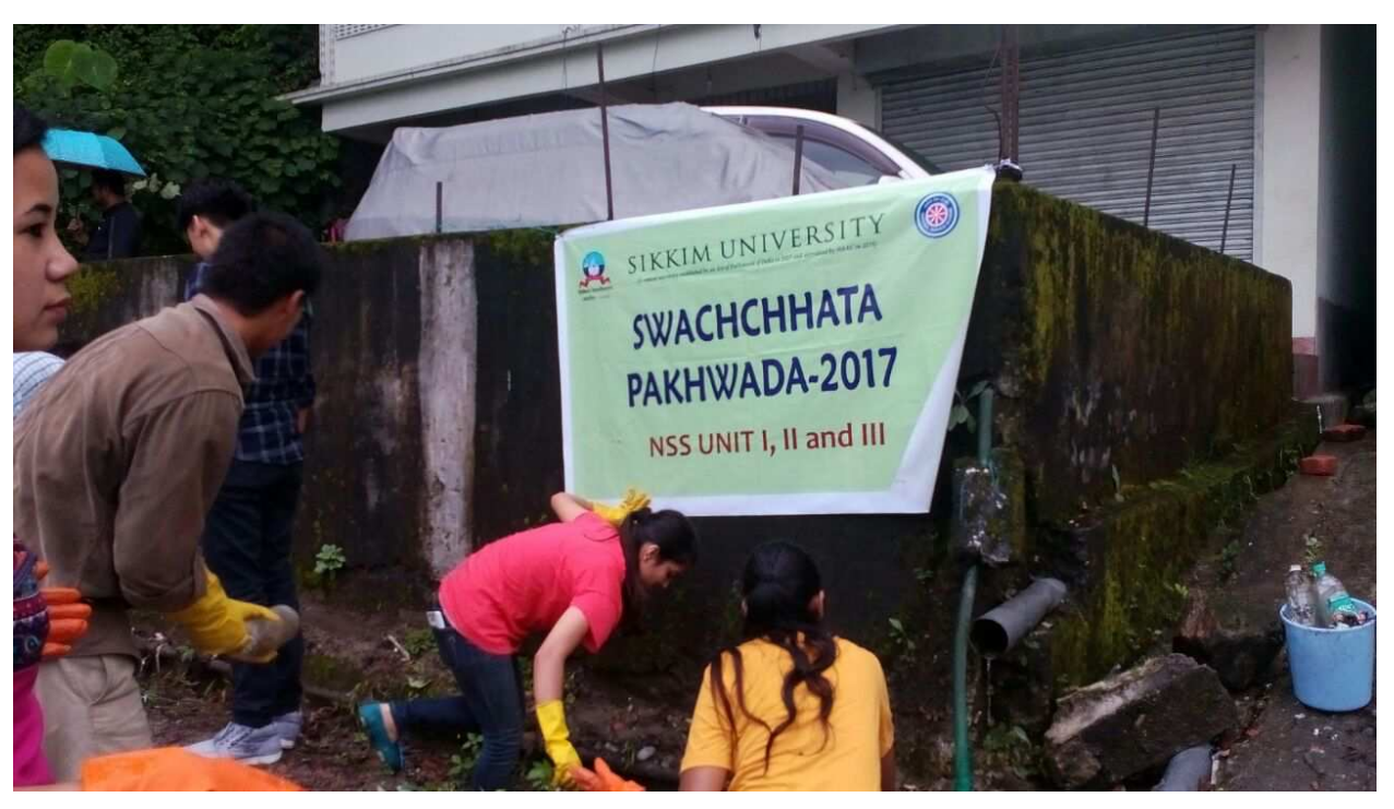
Cleaning drive being conducted by NSS volunteers at Dept. of Management on 10^{\rm th} August, 2017