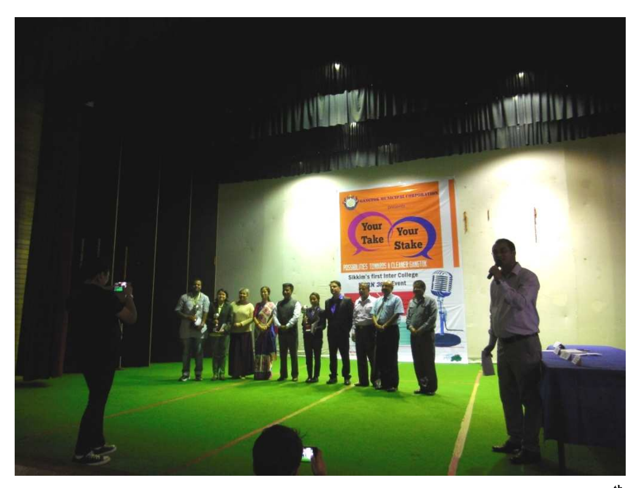
The winners of the competition "Your Take Your Stake" along with dignitaries on 19^{\rm th} September, 2015