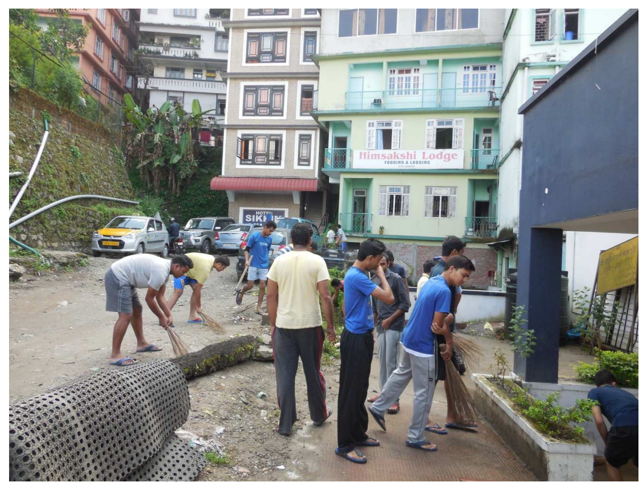
Cleaning Drive organized at Teesta Boys' Hostel, Gangtok on 2<sup>nd</sup> October, 2015