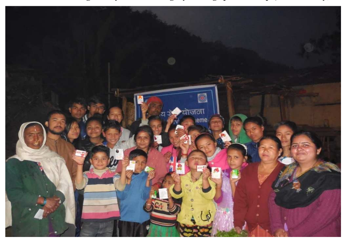
Programme organized by NSS Team at Assamlingzey on 30<sup>th</sup> January, 2015