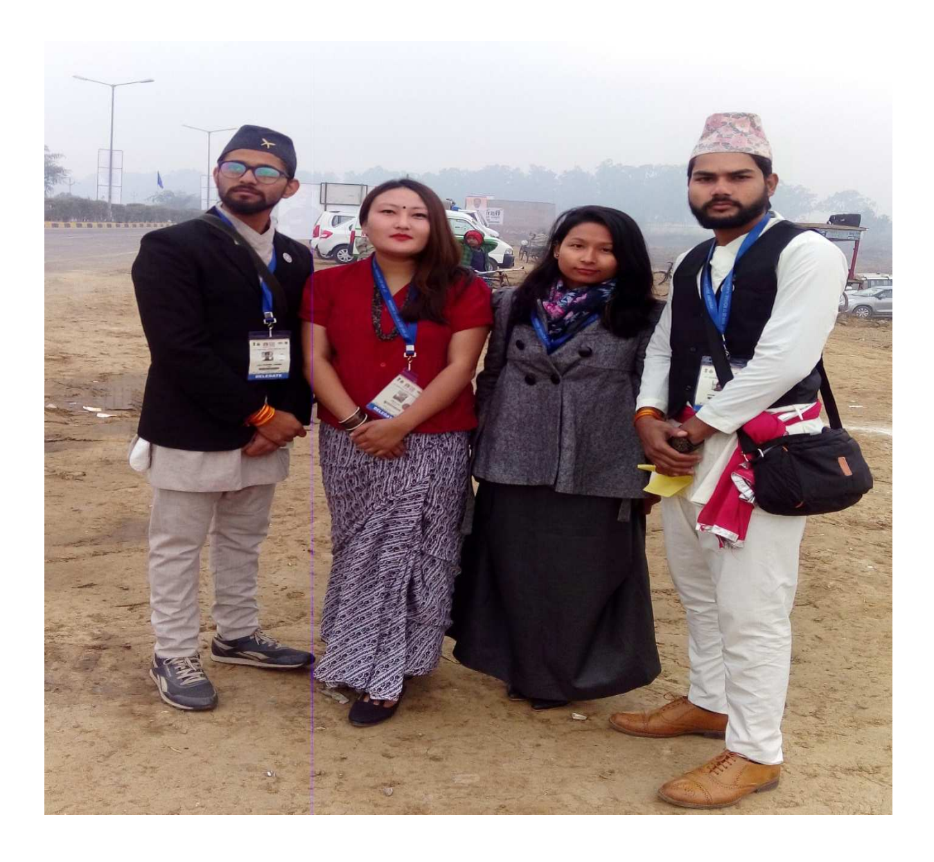
SU NSS volunteers in National Youth Festival at Rohtak, Haryana from 12^{\rm th} to 16^{\rm th} January, 2017