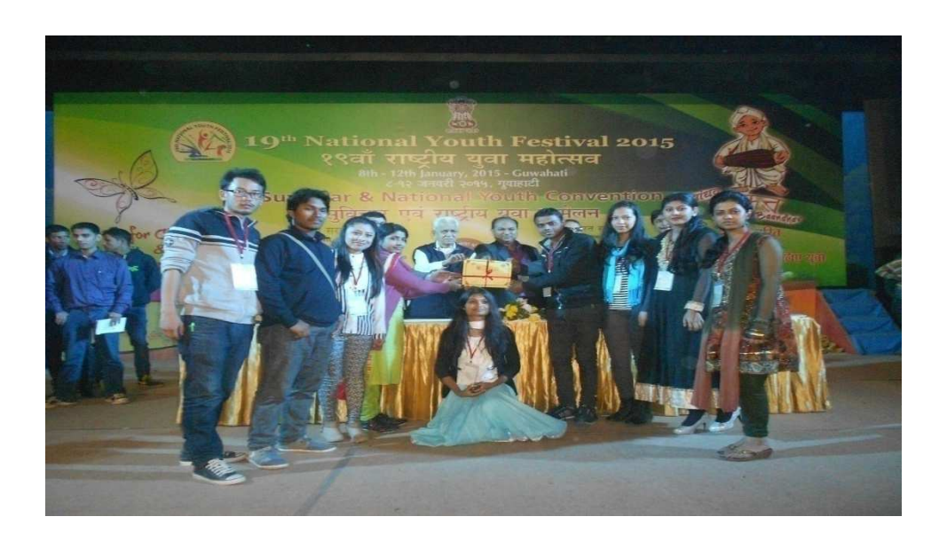
Sikkim University NSS team receiving certificates at Youth Festival on 12<sup>th</sup> January, 2015