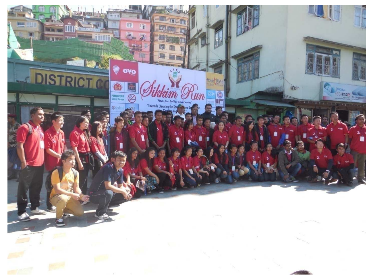
Sikkim University NSS Team along with Shri A.K. Ghatani, Hon'ble Health Minister, Govt. of Sikkim and other dignitaries in Sikkim Run Contest on 1<sup>st</sup> November, 2015