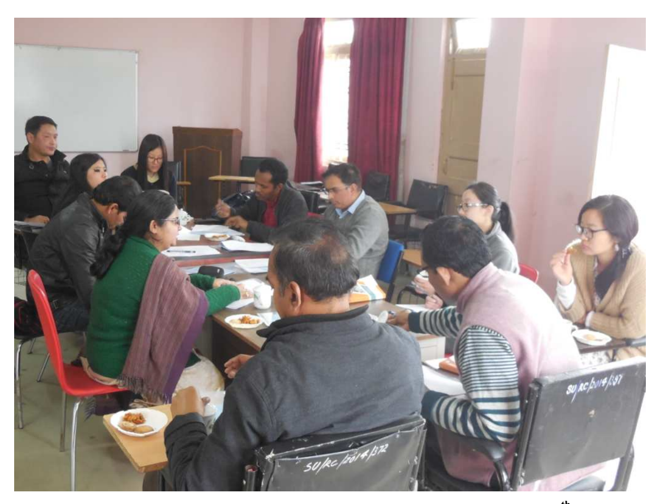
Faculty members while discussion in meeting at Sikkim University on 20^{\text{th}}\, March, 2017\,