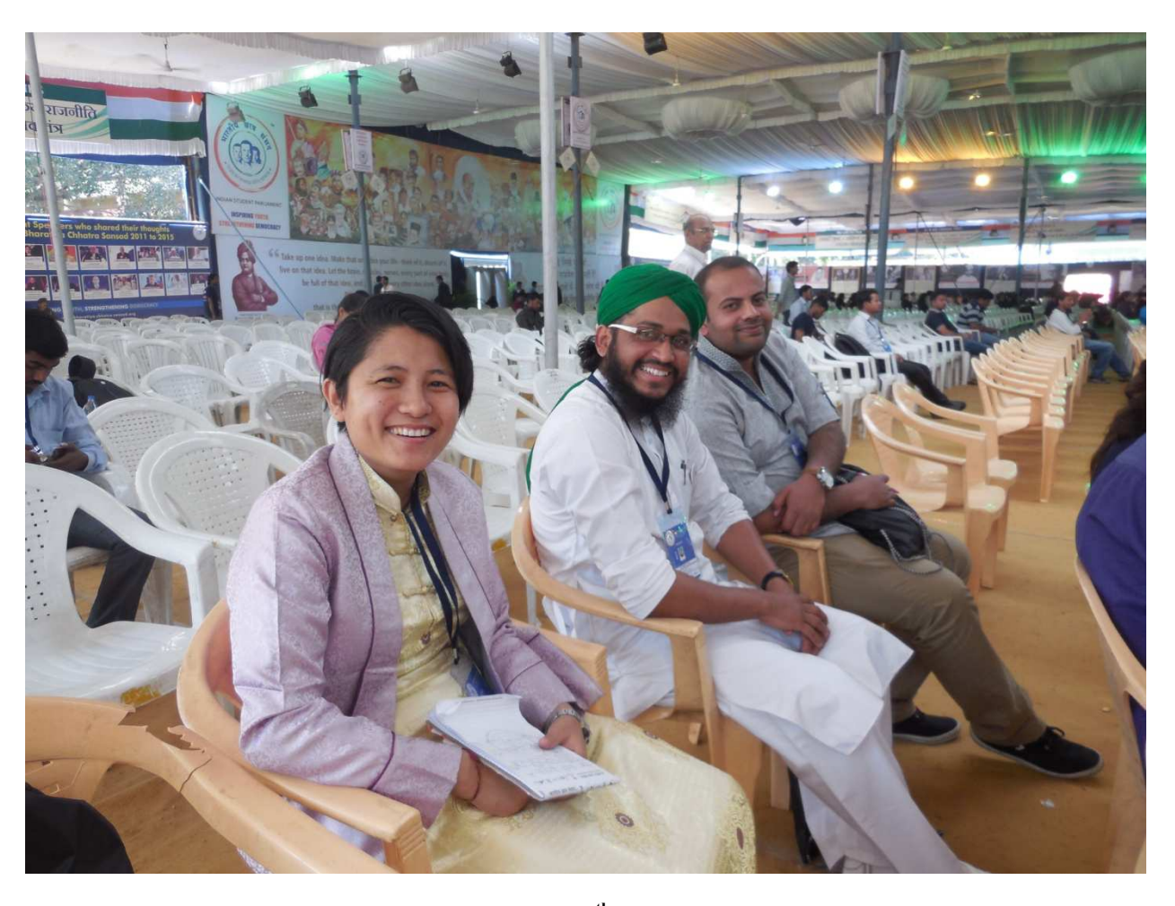
Participating students from Sikkim University at 6^{\rm th} Bharatiya Chhatra Sansad at MAEER's MIT, Pune on 30^{\rm th} January, 2016