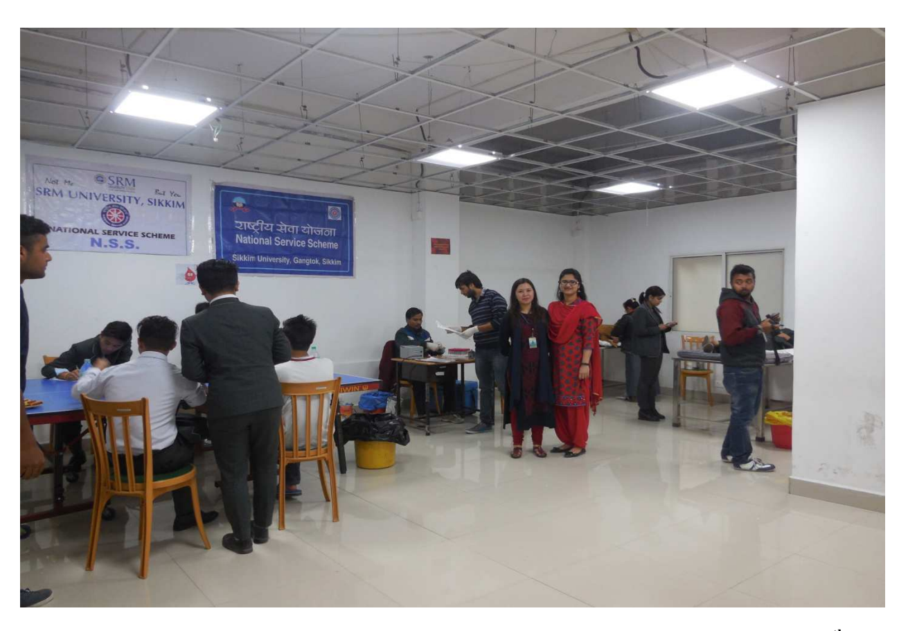
Joint blood donation camp organized by Sikkim University and SRM University on \mathbf{24}^{th} February, \mathbf{2017}