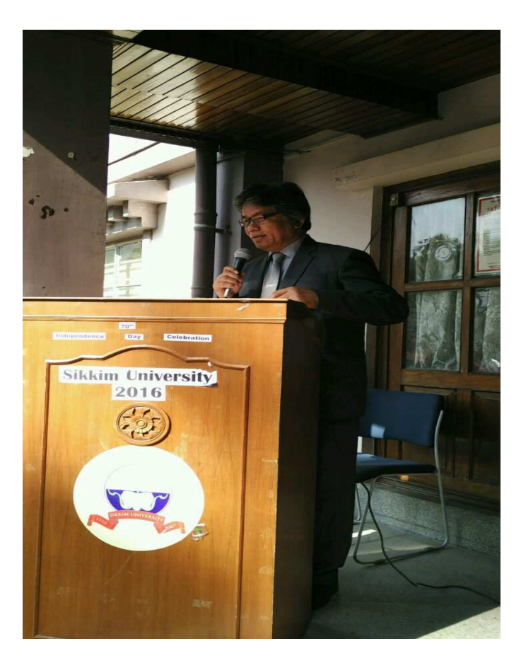
Hon'ble Vice-Chancellor, Sikkim University addressing the gathering at Management Block, 6^{th} Mile on 25^{th} November, 2016