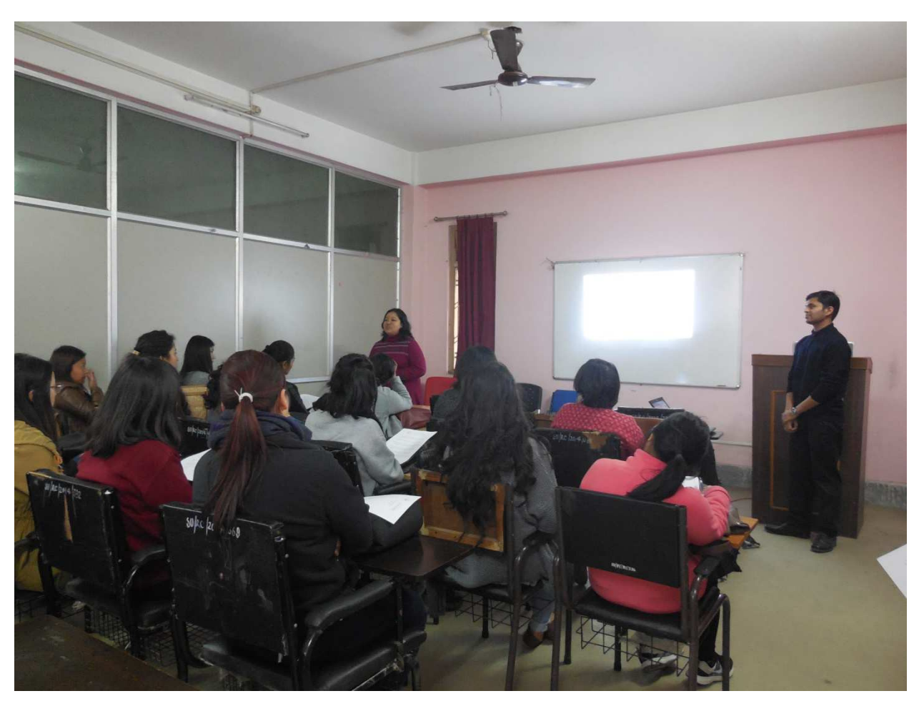
Orientation programme on innovations in teaching methods by resource persons from Sri Sathya Sai Vidya Vahini, Gangtok at Dept. of Horticulture, 6^{\rm th} Mile on 20^{\rm th} March, 2017