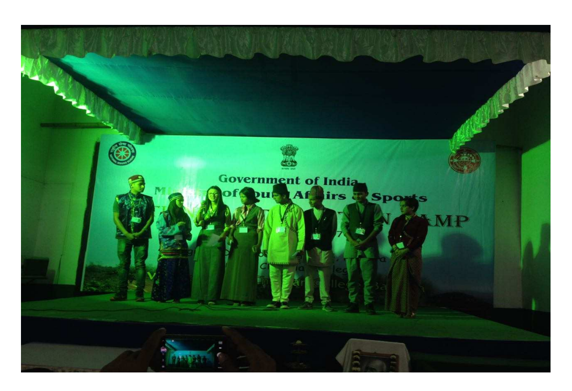
NSS volunteers from Sikkim University and affiliated colleges in National Integration Camp, Bankura, W.B. from 7^{th} - 13^{th} February, 2017