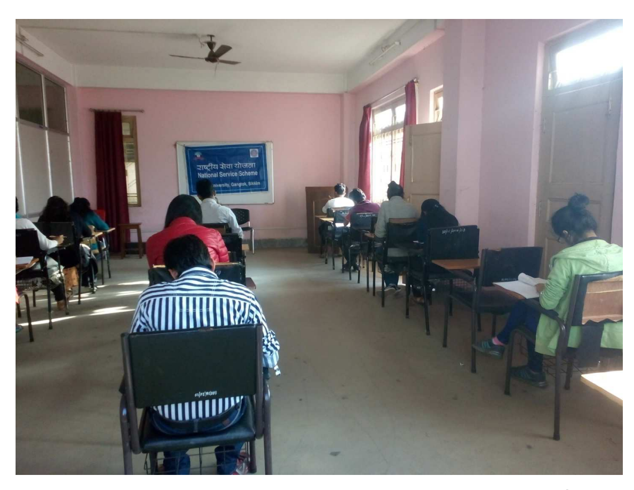
Written quiz competition organized on Constitution day at Dept. of Horticulture, 6^{th} Mile on 26^{th} November, 2016