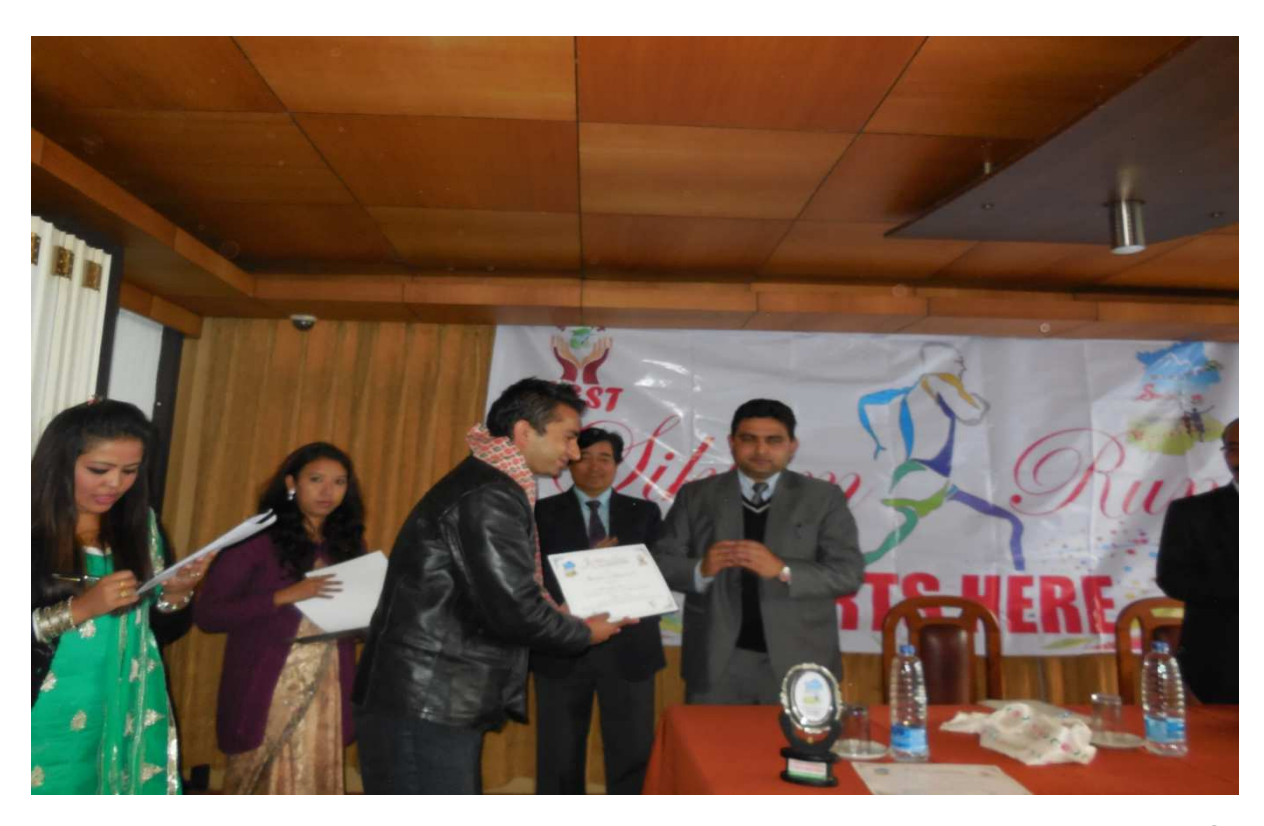
NSS Team receiving felicitation from Hon'ble Health Minister, Govt. of Sikkim on 17<sup>th</sup> November, 2014