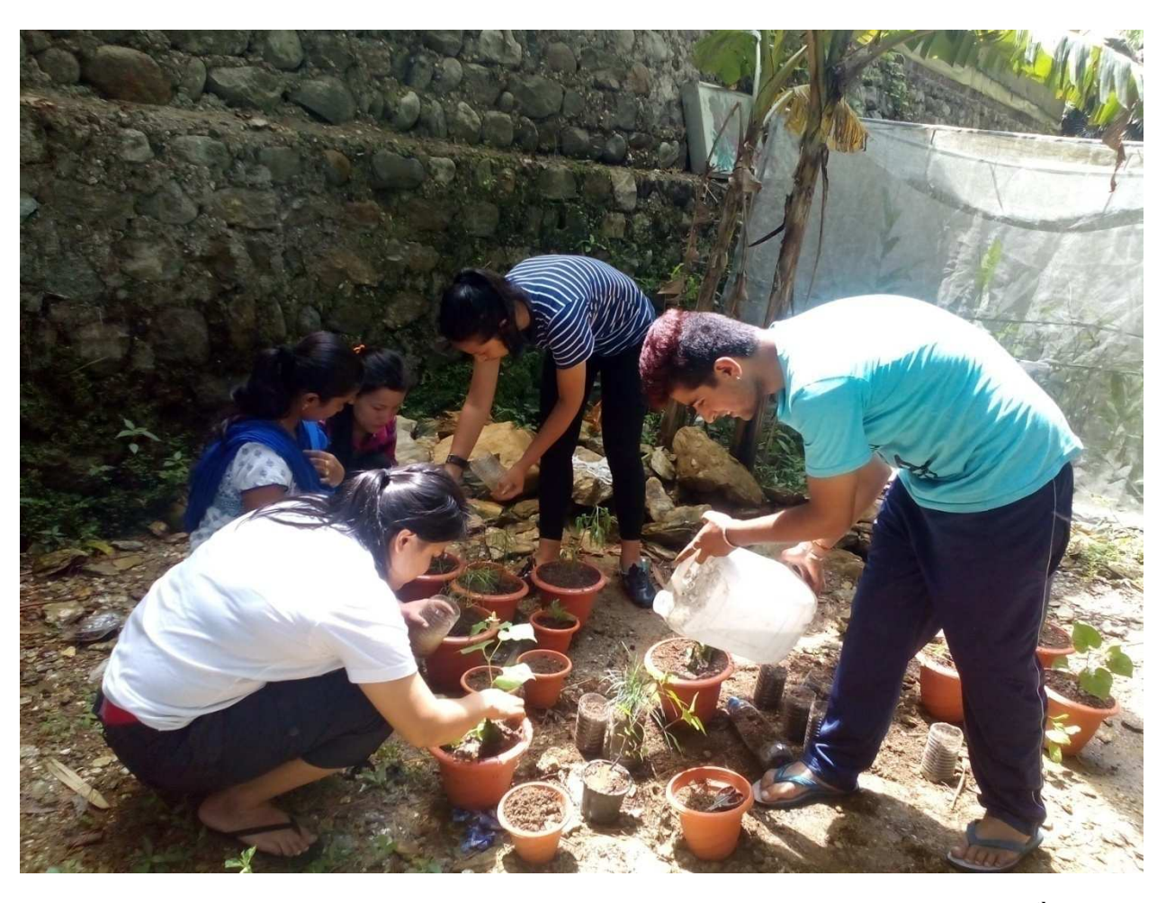
Volunteers planting the medicinal plants in pots on World Environment Day i.e. 5^{\text{th}} June, 2016