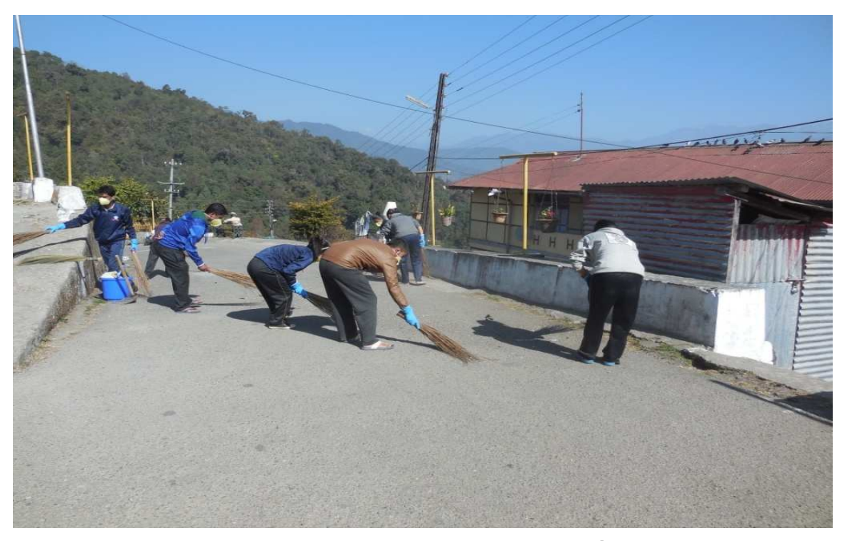
Cleanliness Drive at Rumtek Monastery on 3<sup>rd</sup> February, 2015