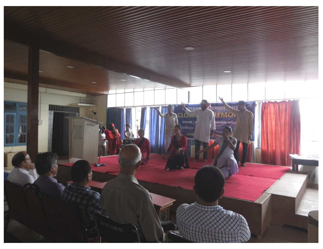
A scene of skit in the beginning showing India as land of prosperity before British rule on 31^{\rm st} August, 2016